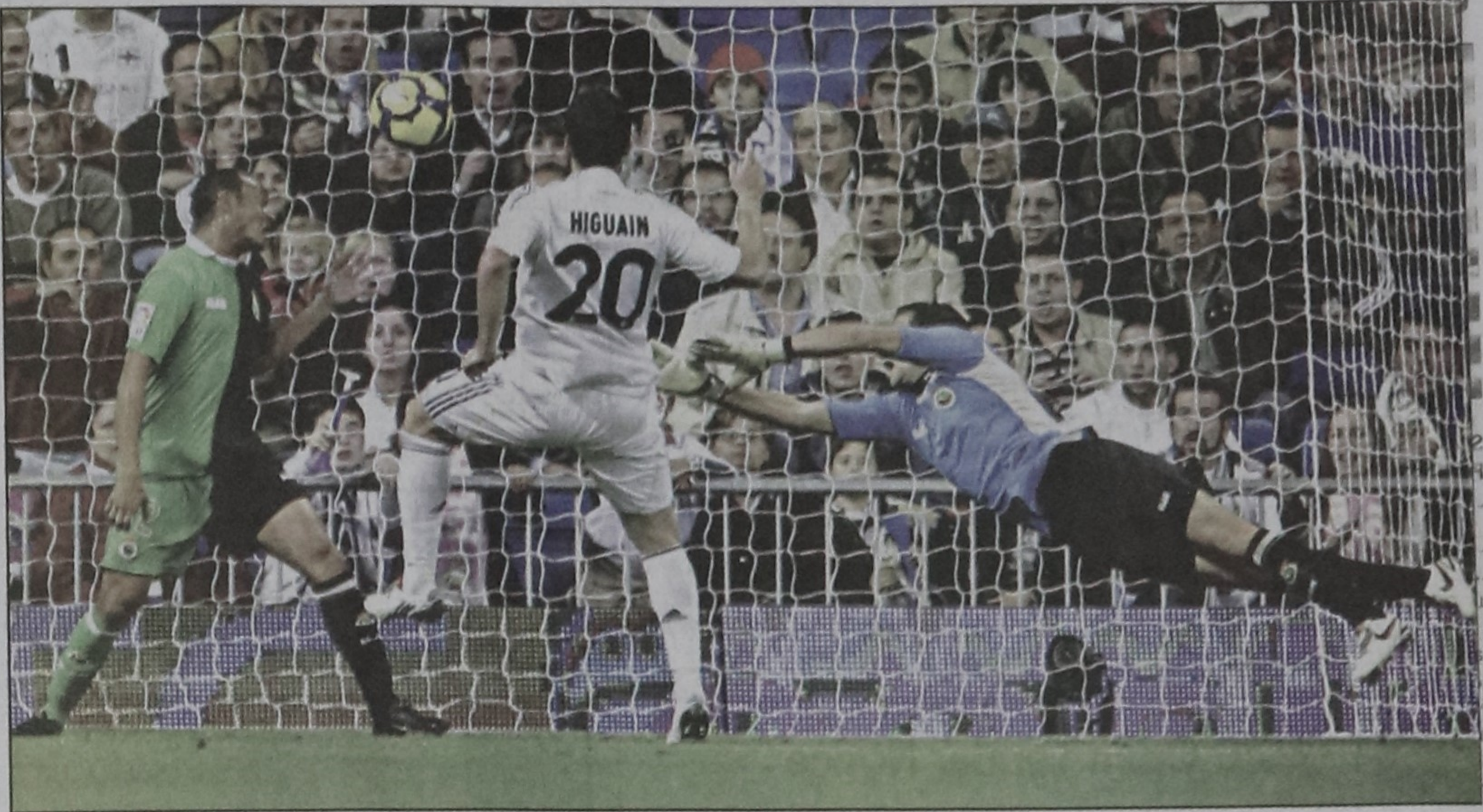
Real Madrid striker Gonzalo Higuain (C) scores past a diving Racing Santander goalkeeper during their Primera Liga clash at the Santiago Bernabeu in Madrid on Saturday.