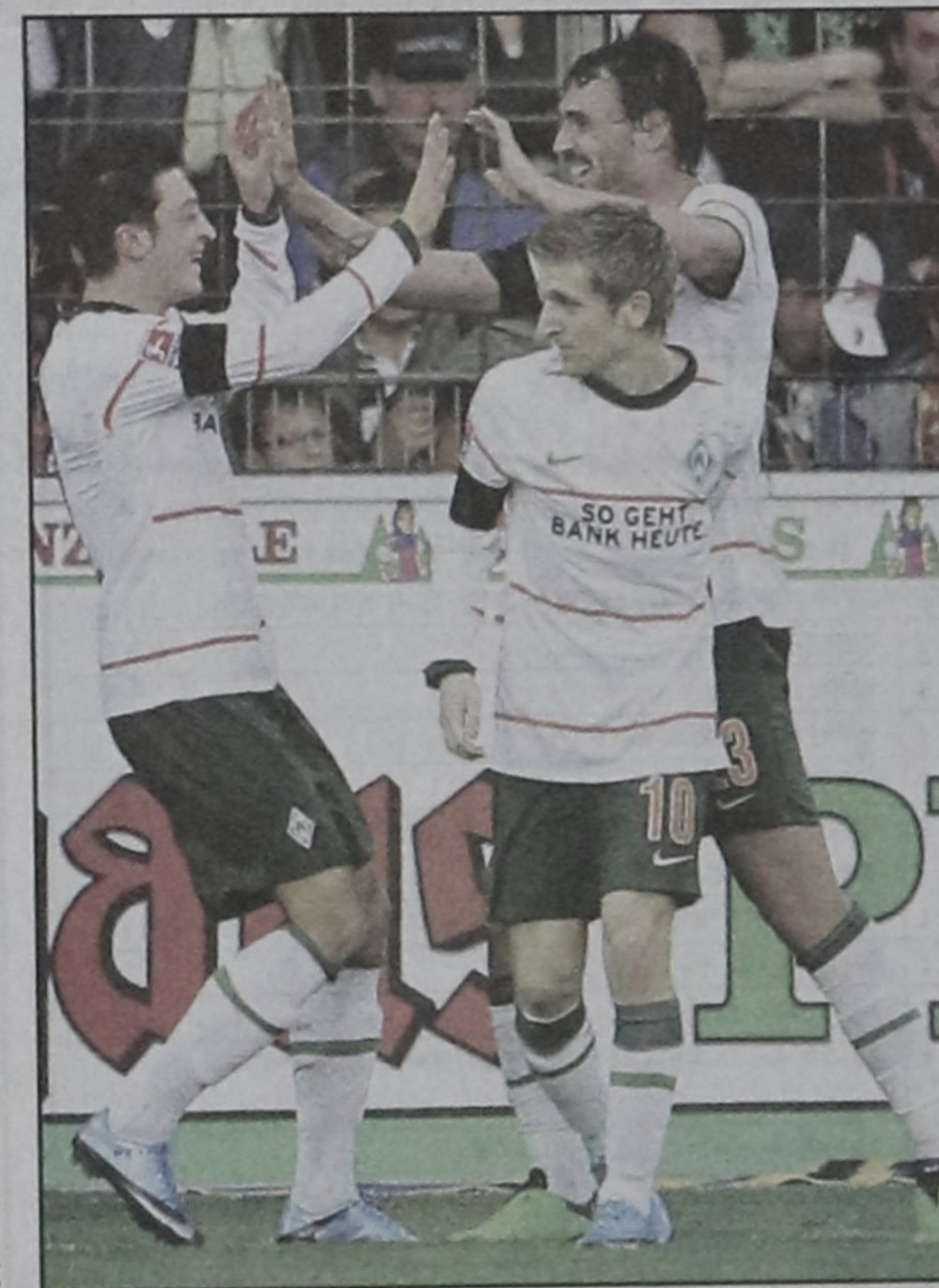
Werder Bremen star Mesut Oezil (L), midfielder Marko Marin (C) and striker Hugo Almeida celebrate the latter's goal during their Bundesliga match against SC Freiburg on Saturday.

Mid-table Eintracht Frankfurt were beaten 2-1 by Borussia Moenchengladbach while Dortmund and Mainz laboured to a goalless draw on Saturday night.