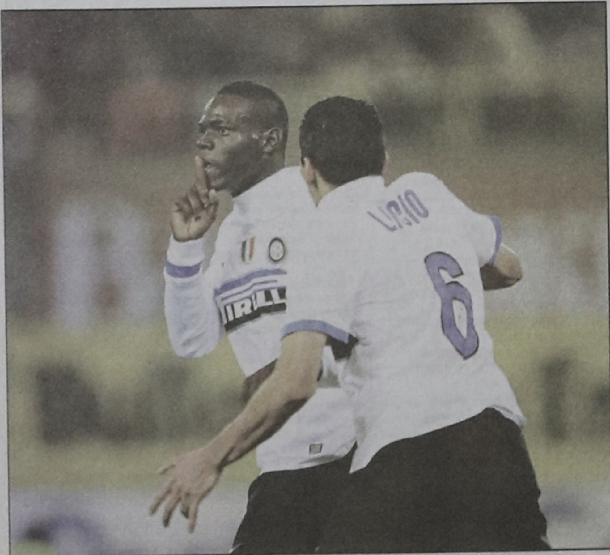
Inter Milan forward Mario Balotelli (L) celebrates with teammate Lucio after scoring against Bologna in their Serie A clash at the Dall'Ara Stadium in Bologna on Saturday.

Martins Adailton's fine left-foot chipped the ball over the Inter defence for Zalayeta, who showed composure to bring the ball down before firing into the top corner as Julio Cesar rushed out.