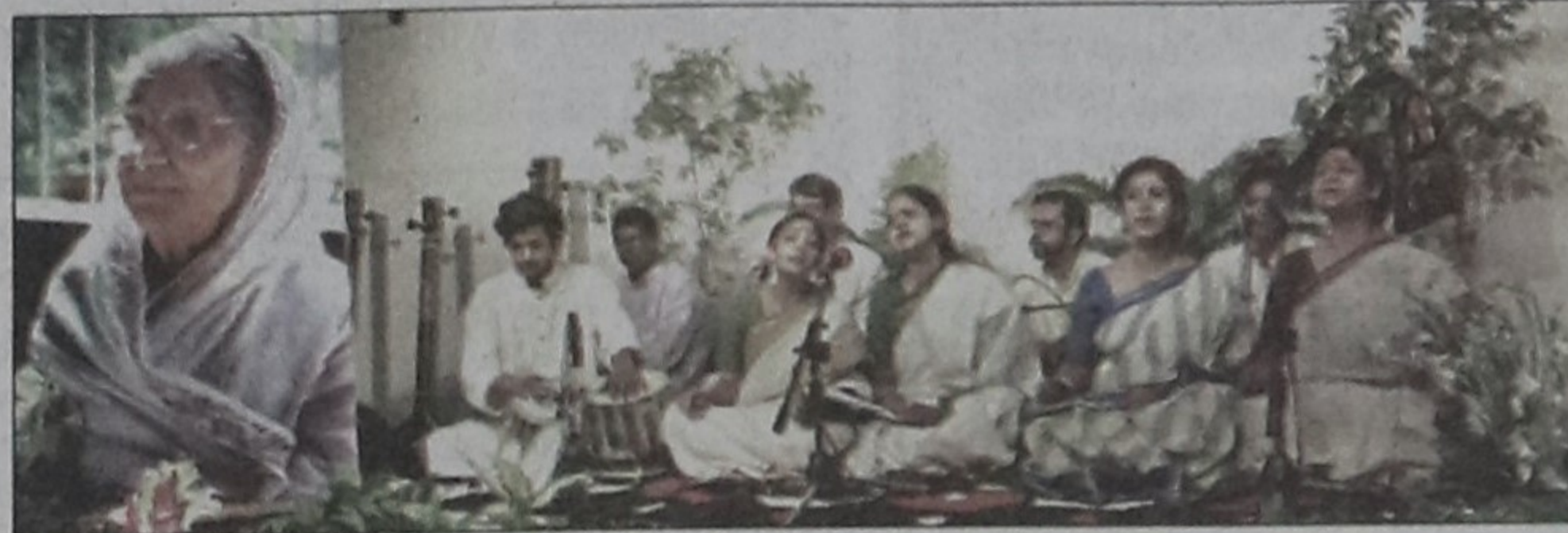
Artistes recall the late Sufia Kamal(left) with songs.