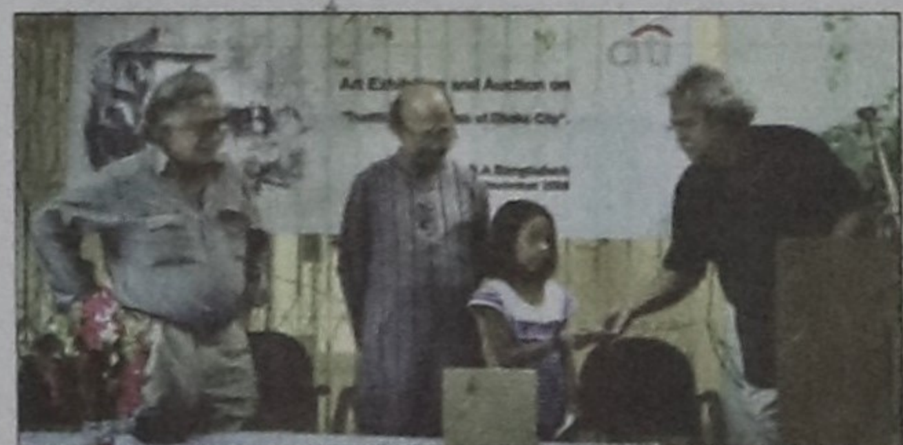
Renowned artists at the event.