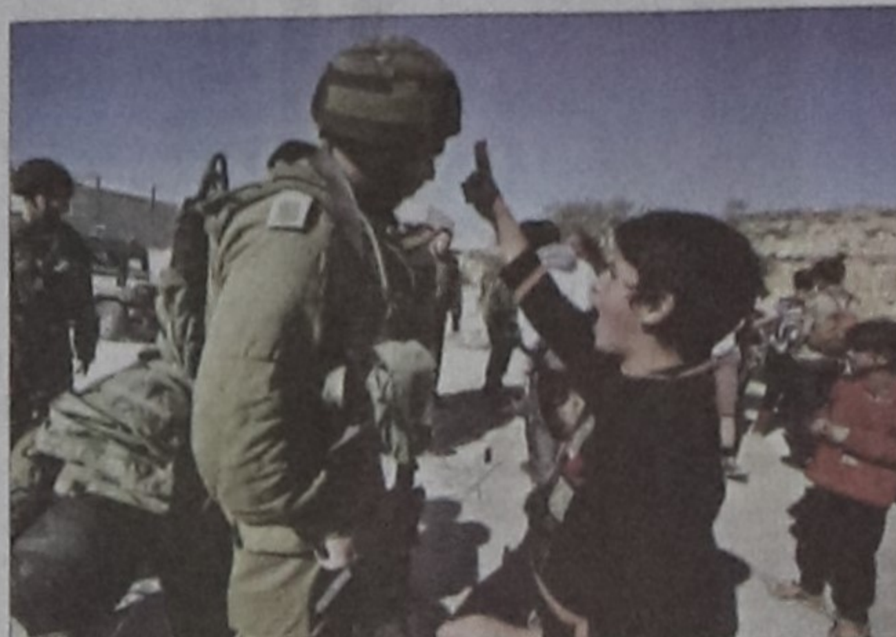
A Palestinian boy flashes the "V" for victory sign at an Israeli army officer during a demonstration against Israel's controversial separation barrier in the West Bank village of Maasarah, near Bethlehem, on Friday.

Deadly street rallies broke out after the vote, with protesters claiming Ahmadinejad's re-election was rigged.