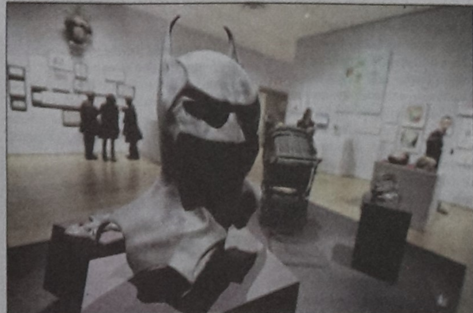
Artworks by Burton at New York's Museum of Modern Art.