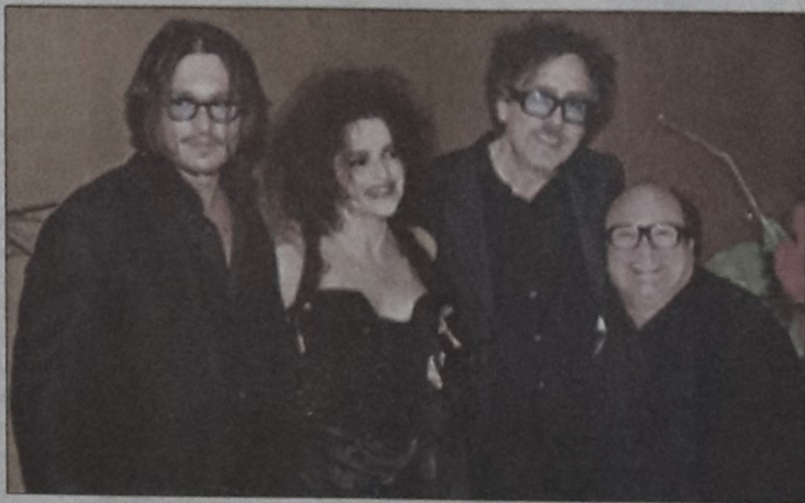
(From left) Johnny Depp, Helena Bonham Carter, Tim Burton and Danny DeVito at the launch of the exhibition.