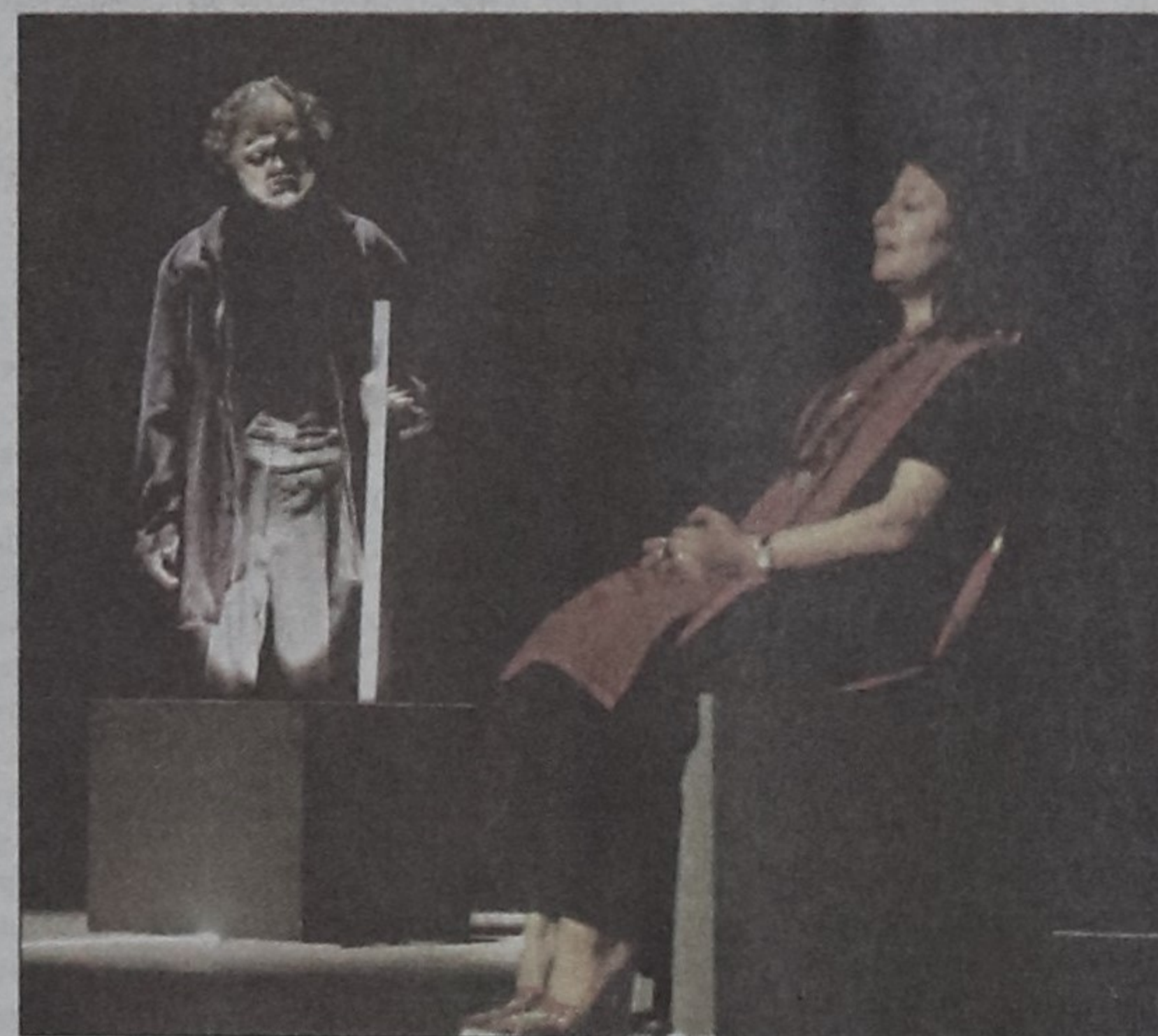
A scene from Aarohan Theatre's production "Mahan Shilpee".

"Mahan Shilpee" zooms in on an individual's ego, self-interest and the ever-lasting conflict between genera-