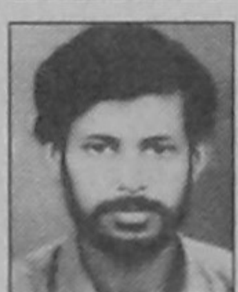
Samad Bir Uttam, says a press release.

He embraced martyrdom in a battle against the occupying Pakistani forces at Bhurungamari in Kurigram during the War of Liberation on this day in 1971. Local people named the area, where he was killed, Samad Nagar.