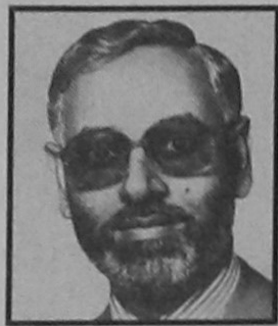
Lt Col Khandaker Abdur Rashid