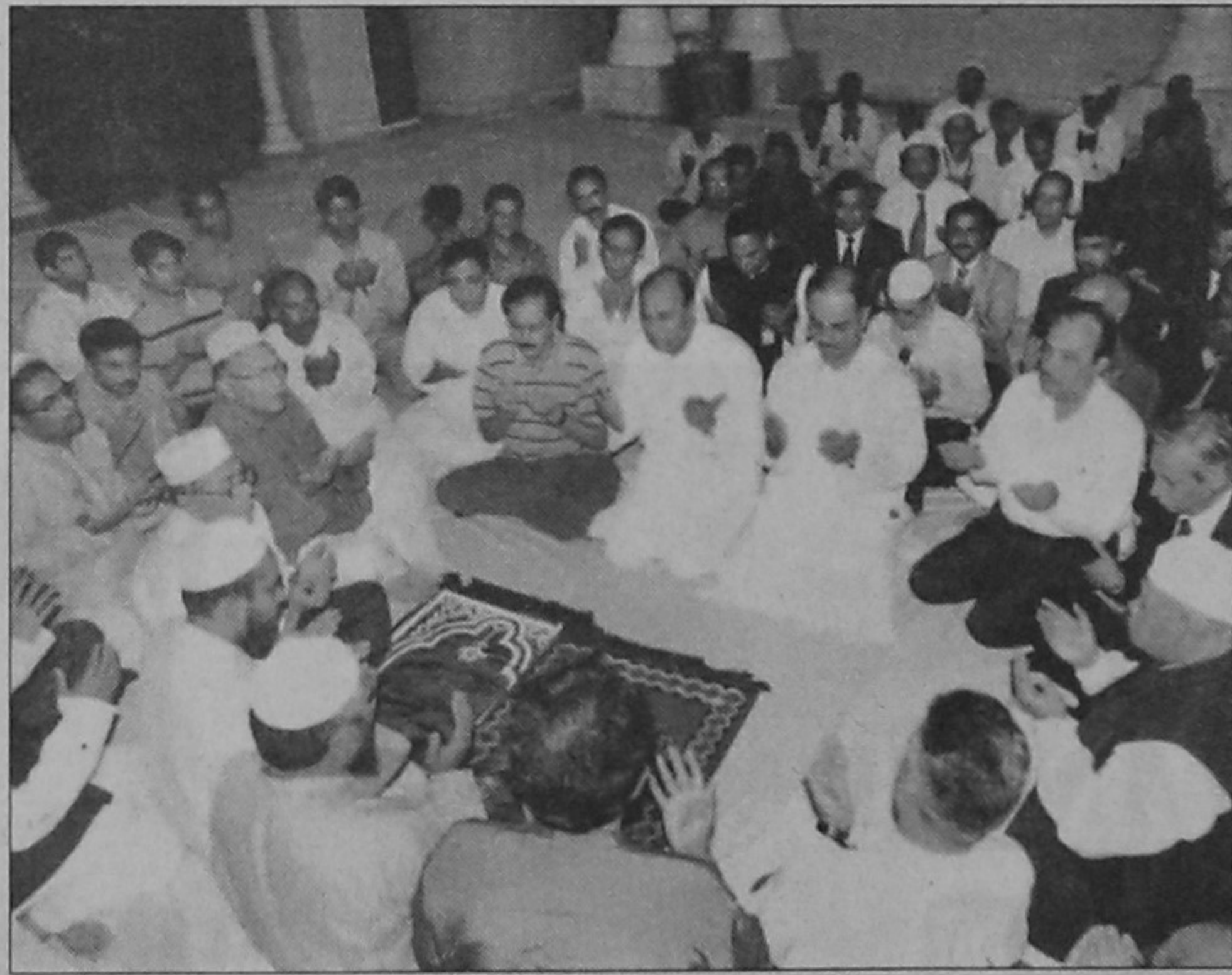
A special doa mahfil was held at the prime minister's official residence Jamuna in the city yesterday after the verdict of the Bangabandhu murder case was announced. Speaker, ministers, Awami League leaders and people from all walks of life attended the milad.