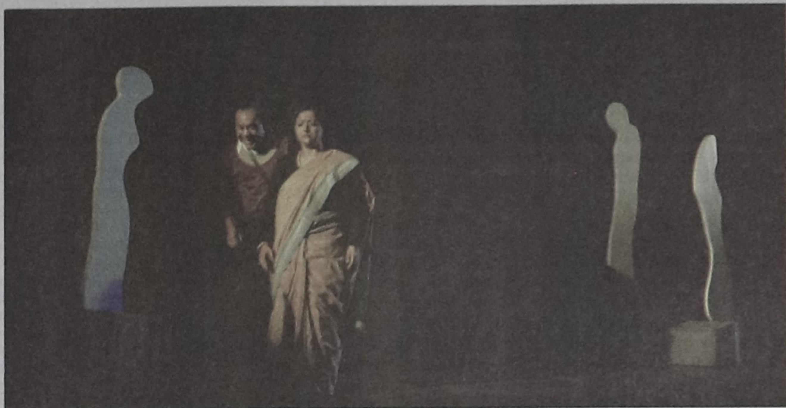
Theatre Art Unit's adaptation of "Ghosts" highlights the psychological state of the characters.