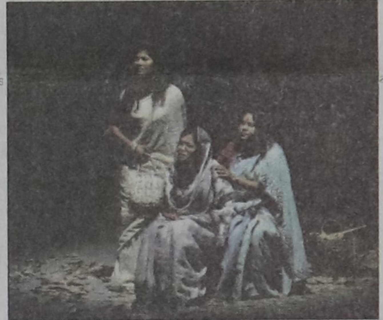
Intensity in "Norar Teen Konya".