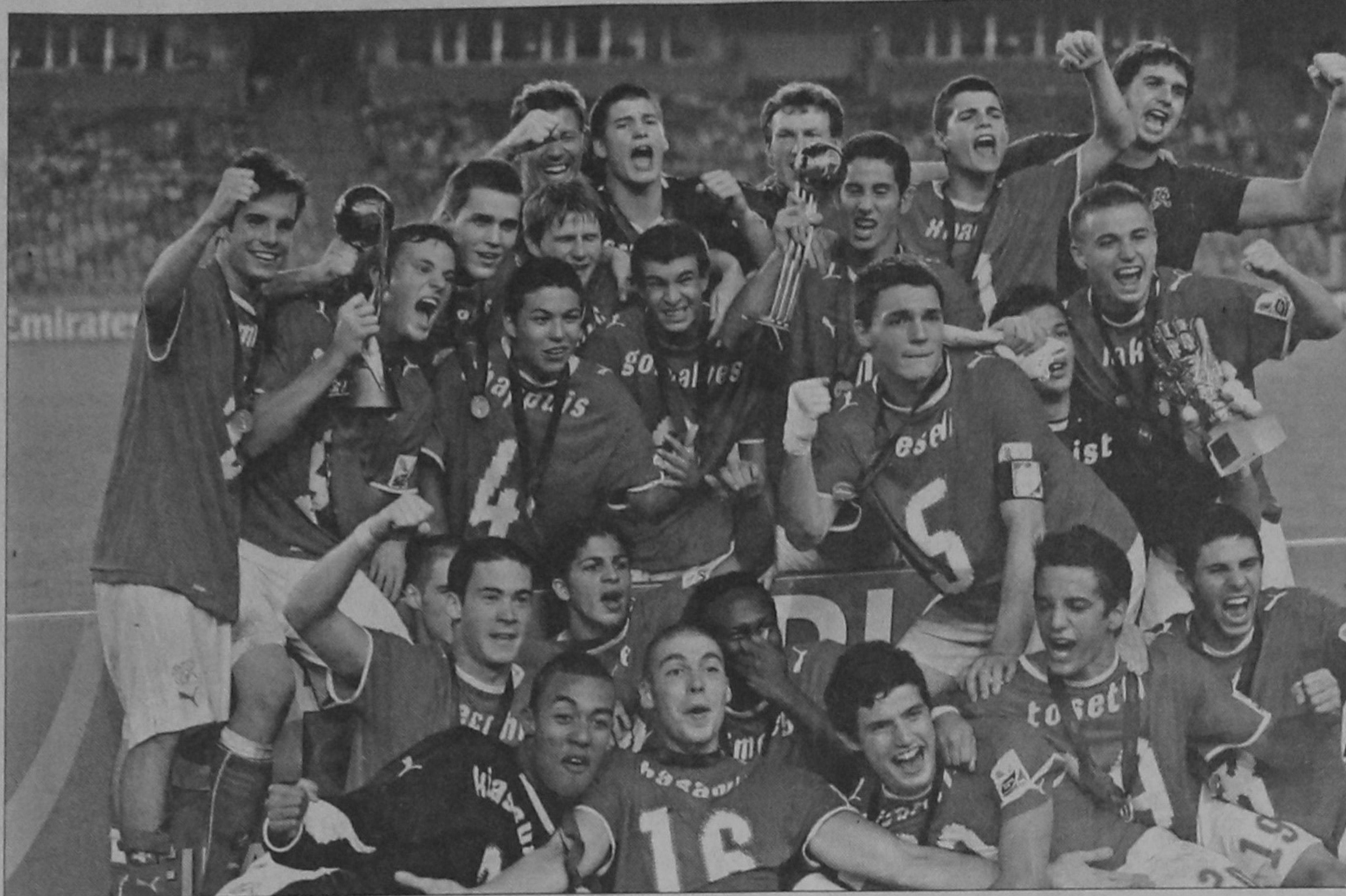
Switzerland players celebrate with the trophy after defeating Nigeria in the U-17 World Cup final in Abuja on Sunday