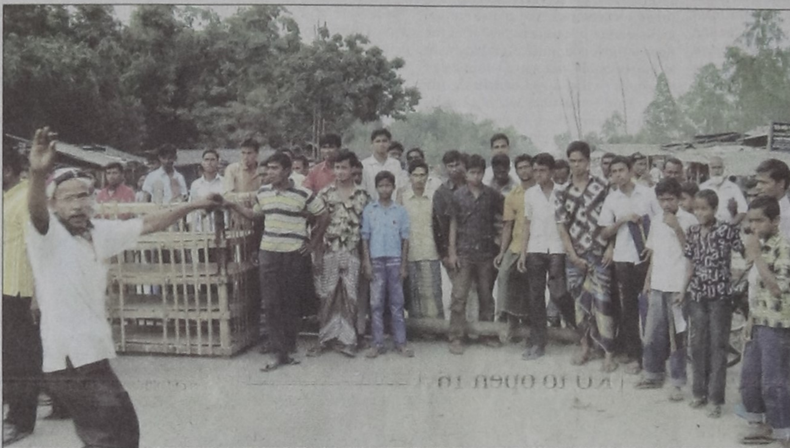
'General' rock lifting workers put up barricades at Buraburi and a few other places on Tentulia-Panchagarh road yesterday demanding an end to rock lifting with dredgers from Dahuk River.

"We are going to hold the council to elect the leaders of the upazila unit through democratic process," the leaders said.