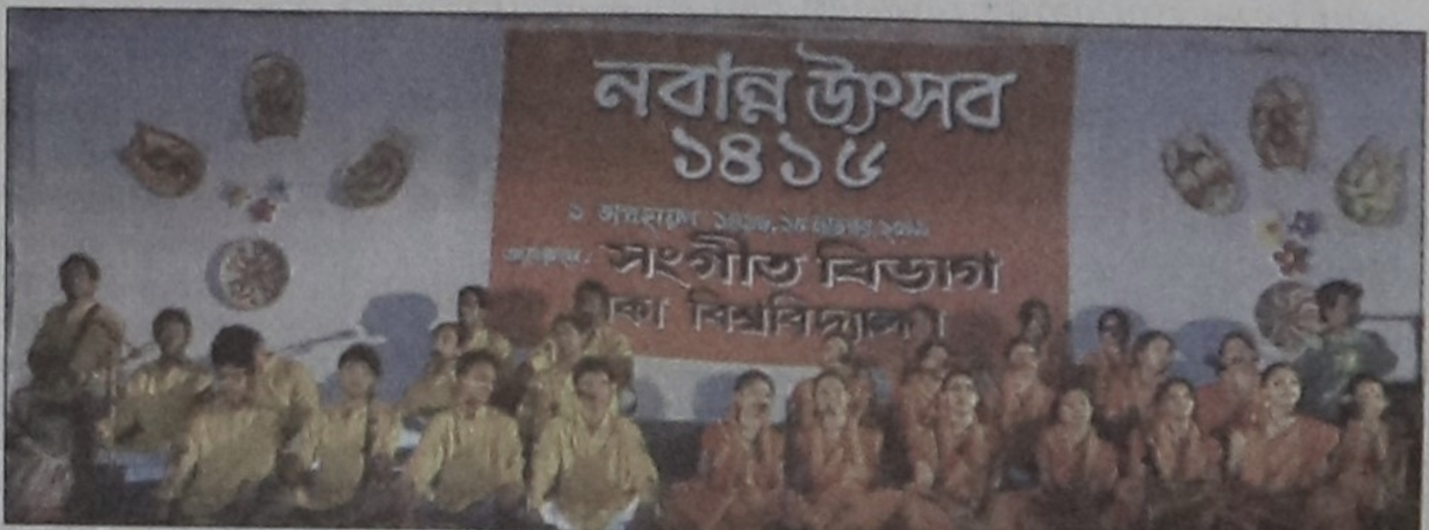
DU students perform at the Nobanno celebration.

Prior to the musical programme, a colourful procession marking the onset of Nobanno was taken out from the Aparajeyo Bangla grounds and circled the campus.