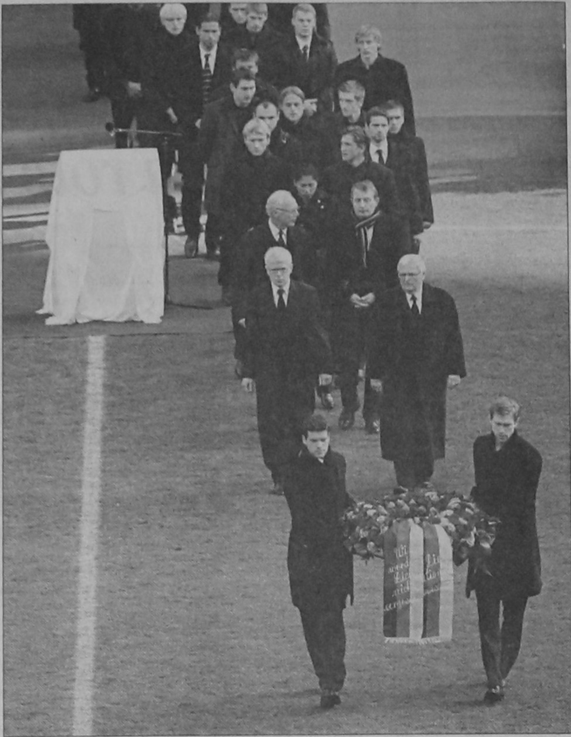
German captain Michael Ballack (L) and defender Per Mertesacker lead a train of mourners as they carry a wreath to be laid on the coffin of deceased teammate Robert Enke at the stadium in Hanover on Sunday. German football stars past and present joined tens of thousands of fans in Hanover to pay their last respects to Enke, who committed suicide last week.

(Brazil soccer coach) "I want to be remembered as a winner. You should not forget that if Brazil has won a lot of competitions it is because we have had the best defenders as well as the best strikers."