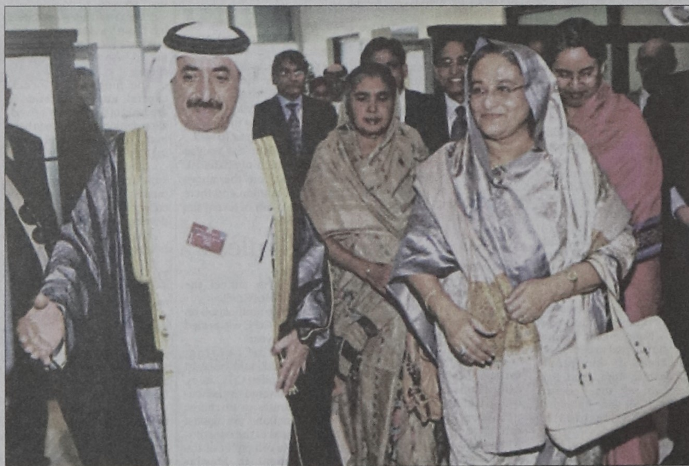
A high-profile delegation of the UAE government receives Prime Minister Sheikh Hasina as she arrives at the Dubai International Airport yesterday.