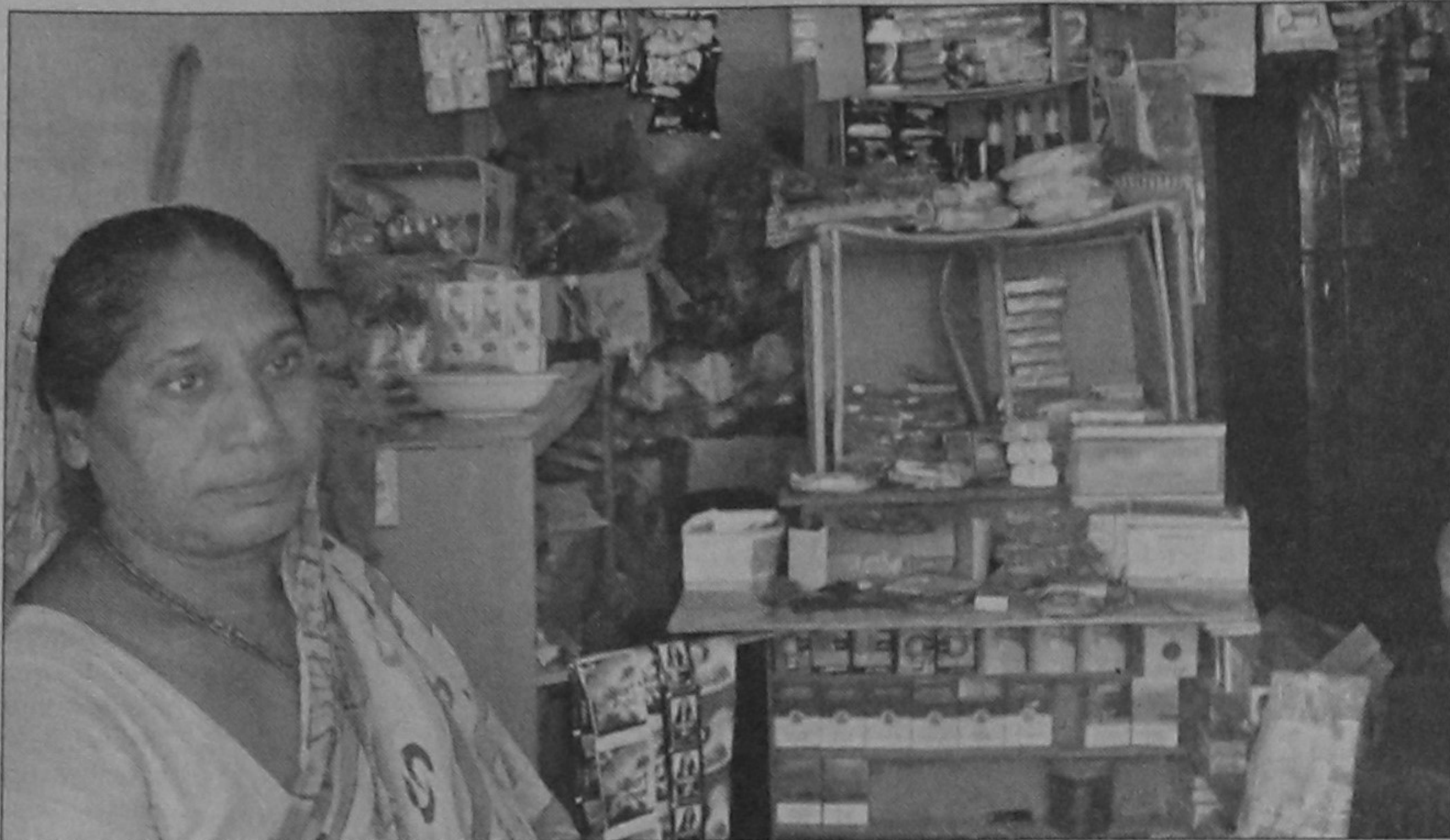
A shopkeeper waits for customers at Boubazaar in Magura. The women-operated market let the poor women be self-reliant to a great extent.

"I feel comfortable shopping here as bargaining with a female shopkeeper is much easier than with a male vendor," said Sheuly Begum, a housewife of Parla village.