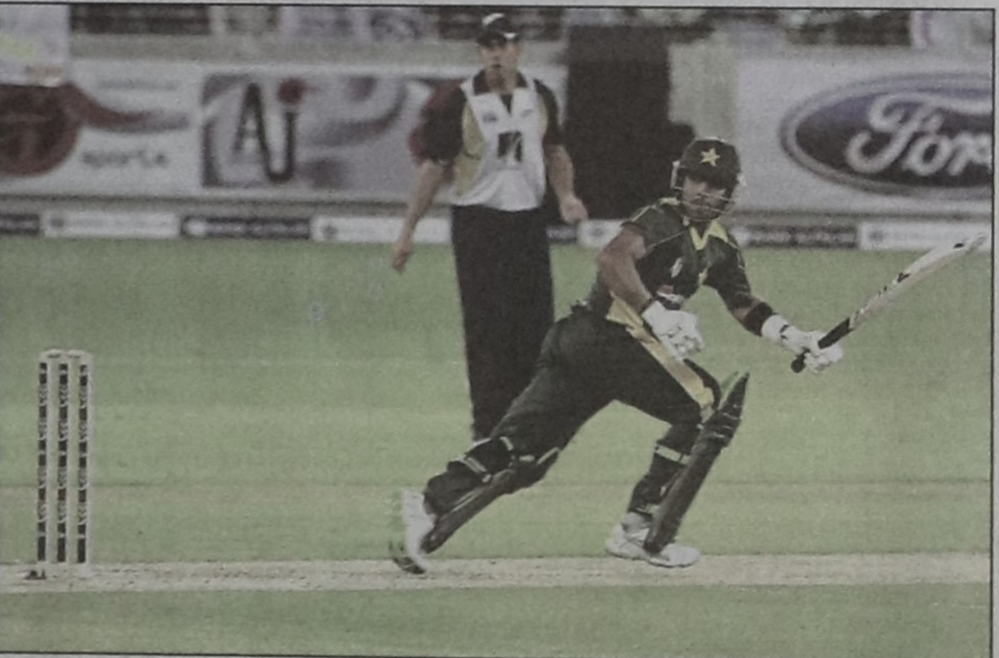
Pakistan top-order batsman Umer Akmal sets off for a run during the second and final Twenty20 international against New Zealand in Dubai on Friday. Akmal hit a maiden half-century to guide Pakistan to a seven-run win and 2-0 series victory.