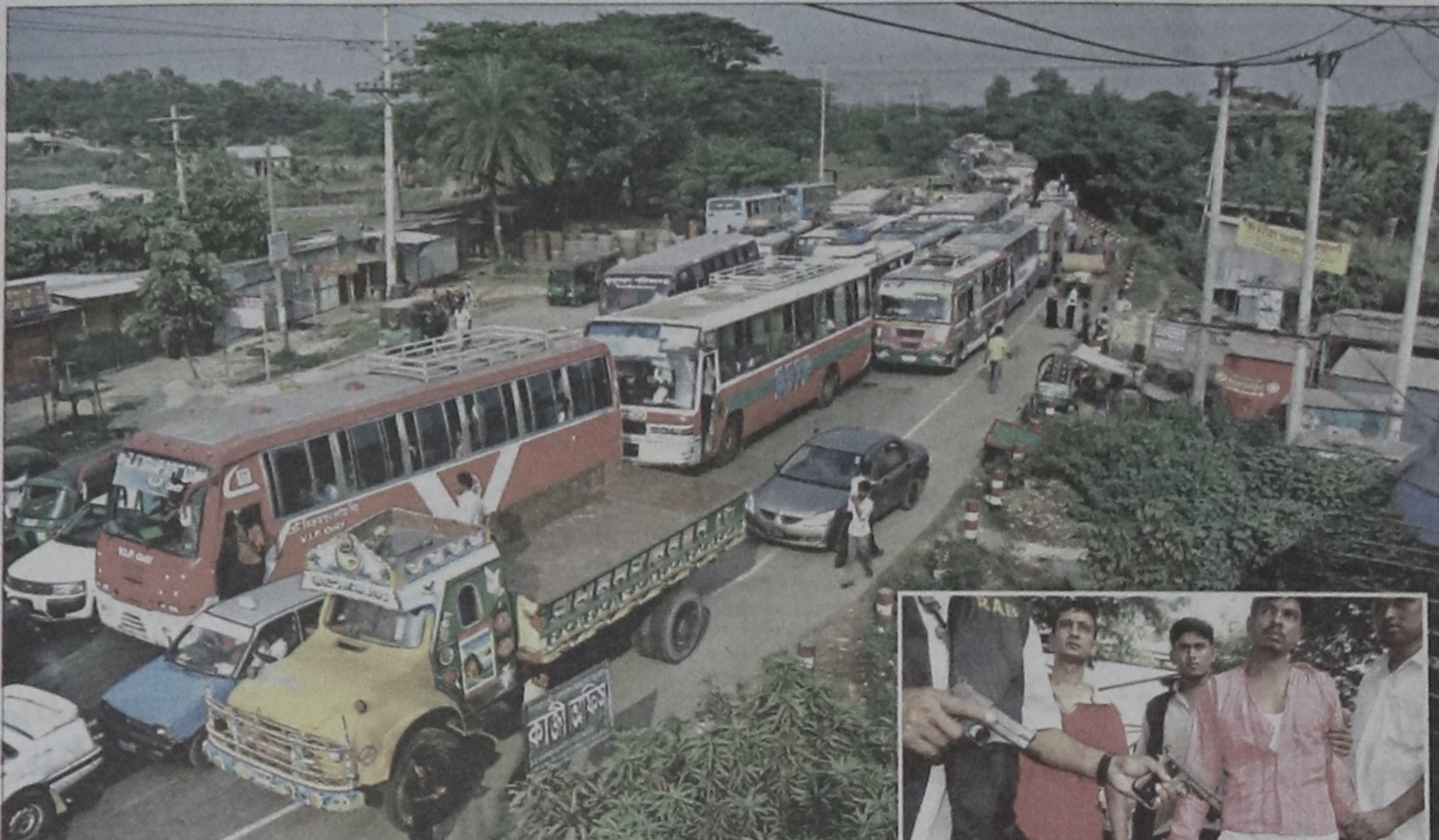
Rush-hour traffic halts for hours on Dhaka-Mawa highway as two groups clashed following a dispute over two cattle markets in Keraniganj yesterday morning. Inset, Rab holds two persons with pistols during the fight.