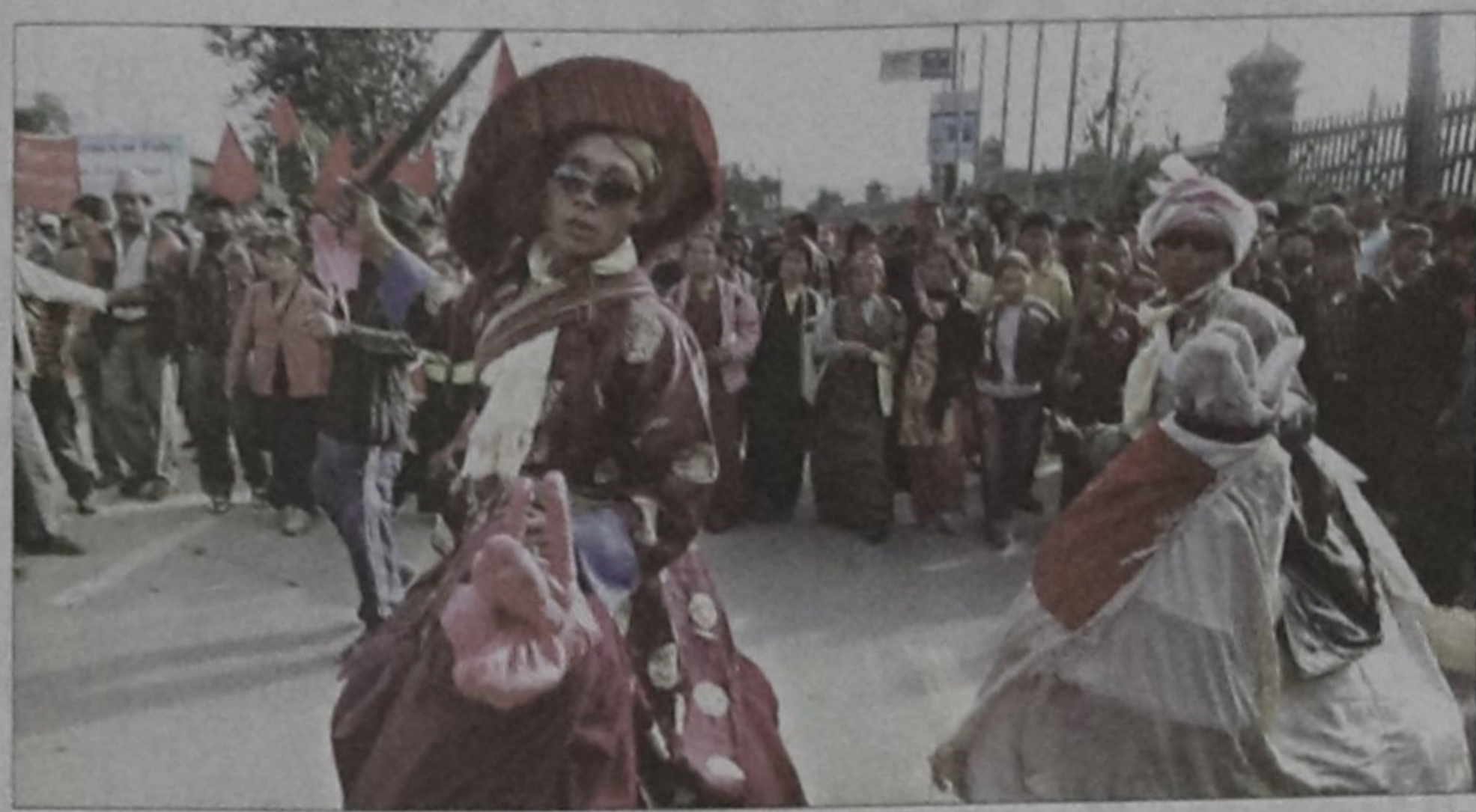
Maoist activists dance during anti-government protests in Kathmandu on Friday. The leaders of Nepal's opposition Maoists threatened "more aggressive" protests if the government fails to meet their demands, after thousands of activists blockaded the capital Kathmandu.