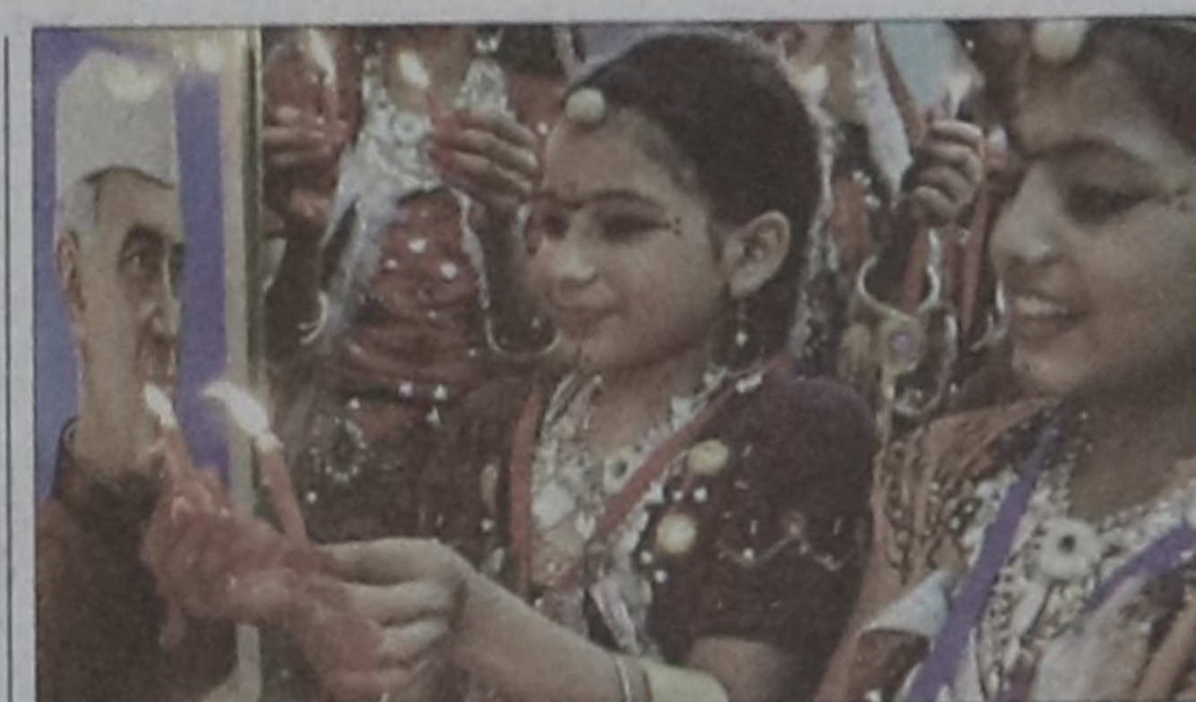
Indian children pay tribute to the India's first prime minister Pandit Jawaharlal Nehru on his 120th birth anniversary in Amritsar yesterday.

On his reported statement that the new BJP president would be from outside Delhi, he said he had only articulated the views expressed by the BJP leadership.