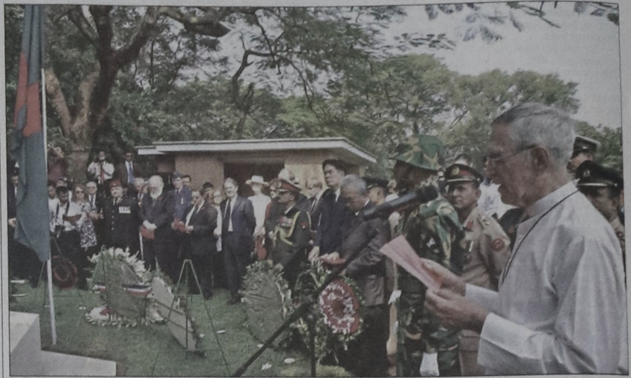
Envoys and representatives of 16 Commonwealth countries yesterday morning attend a special prayer for the World War II heroes at Mainamati War Cemetery in Comilla on the occasion of the Remembrance Day.