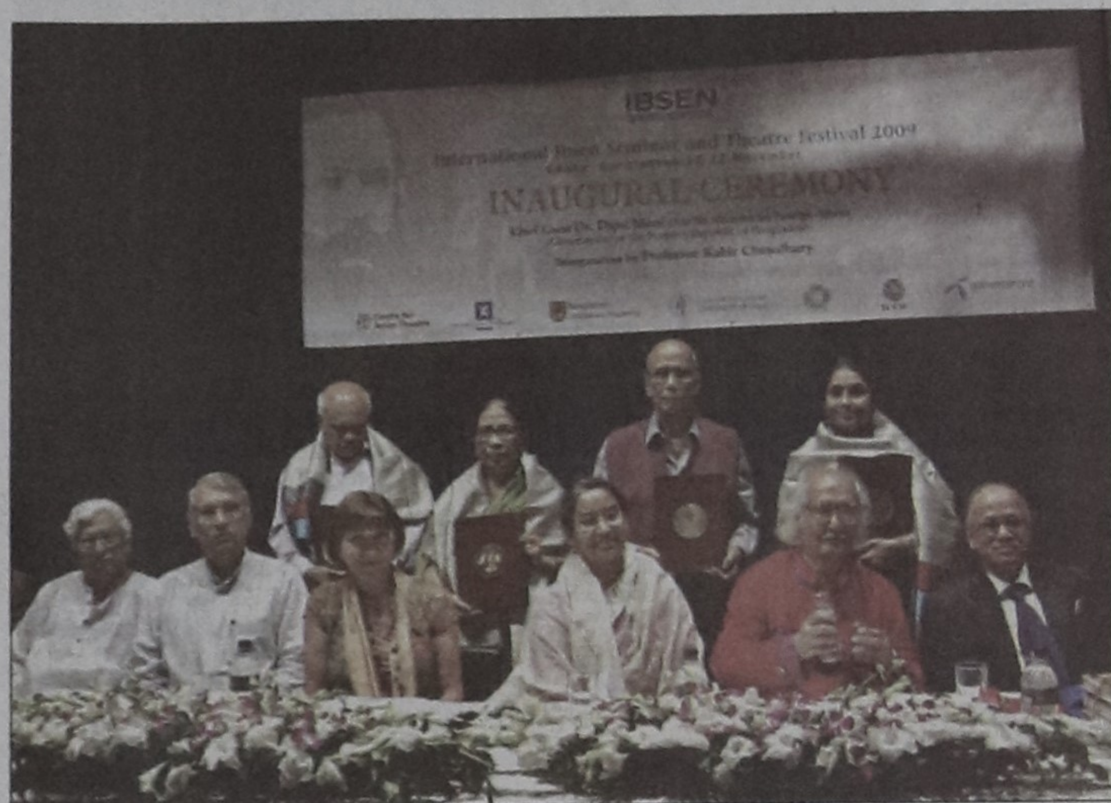
Honorees (back row) with the discussants at the programme.

International Ibsen Seminar and Theatre Festival '09 begins