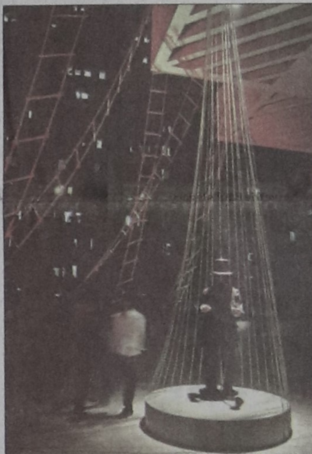
An installation has been placed at the lobby of BSA on the occasion.