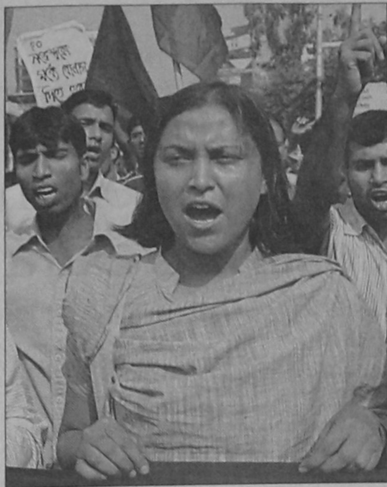
Garment Sramik Trade Union Kendra stages a demonstration in the city yesterday demanding payment of wages as well as bonuses to garment workers.