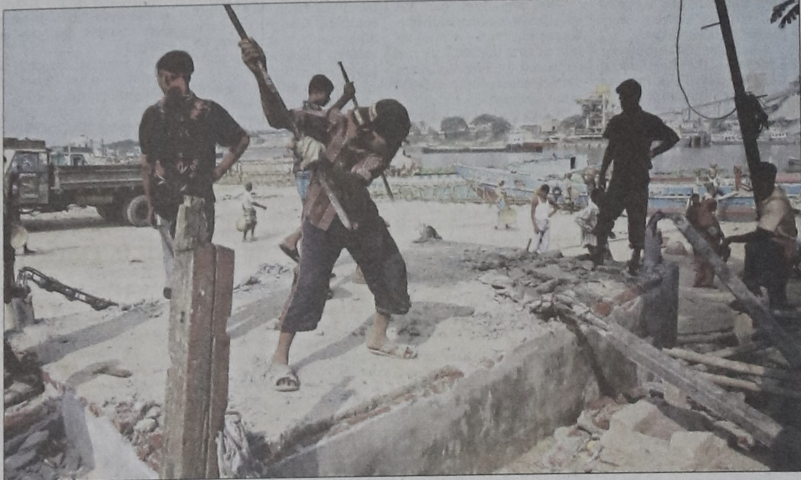
BIWTA and Narayanganj district administration in a joint drive remove an illegal structure on the bank of the Shitalakhya near Kanchpur Bridge yesterday.