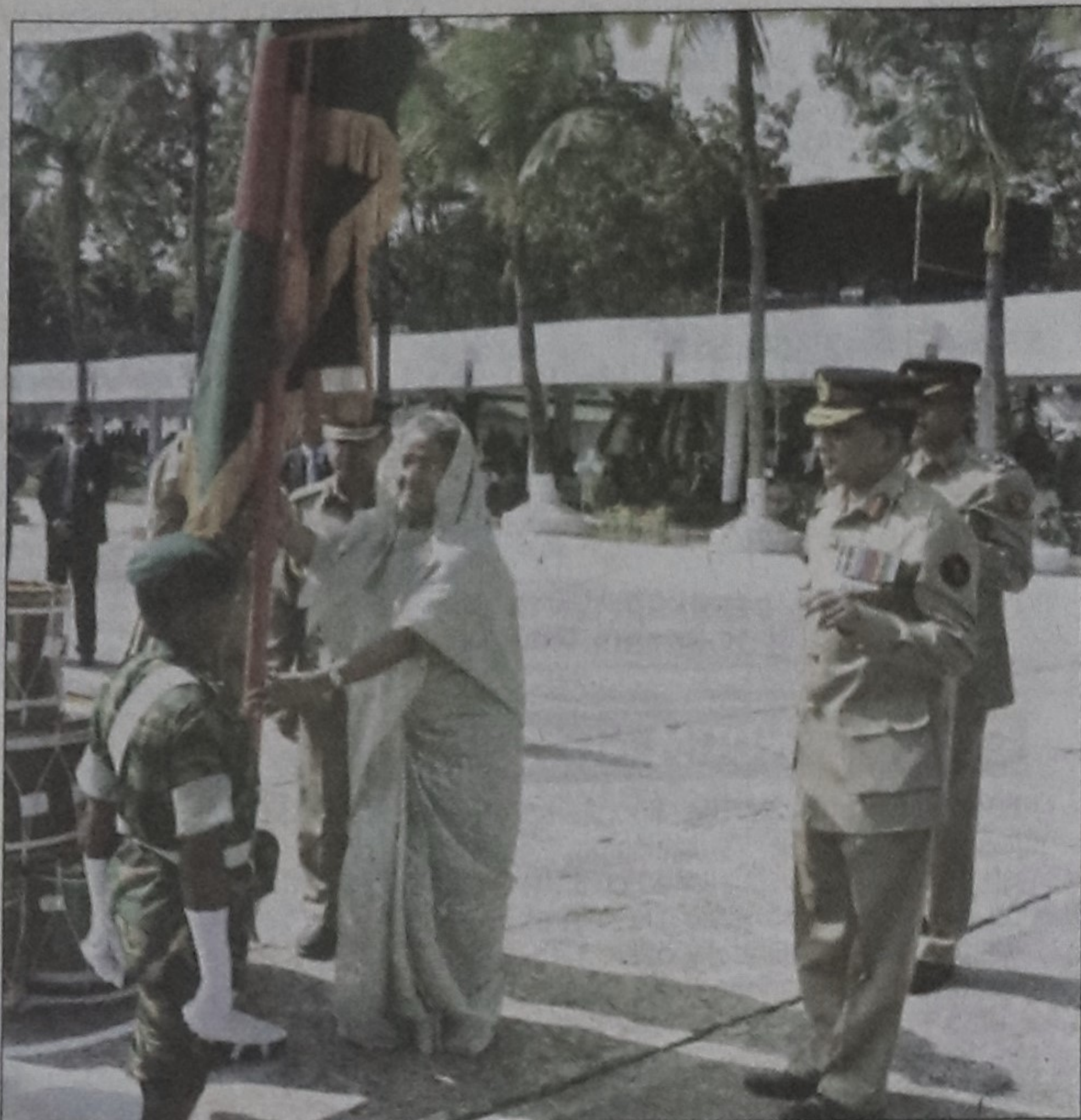
Prime Minister Sheikh Hasina presents National Standard to a unit of East Bengal Regiment at MR Chowdhury Parade Ground of East Bengal Regimental Centre in Chittagong Cantonment yesterday. (Story on Page 1)

Court Inspector Md Khorshid Alam, in absence of AC prosecution, said they did not receive any such message. But following apprehension of feared bomb explosion, security measure was taken in and around the court building since the morning.