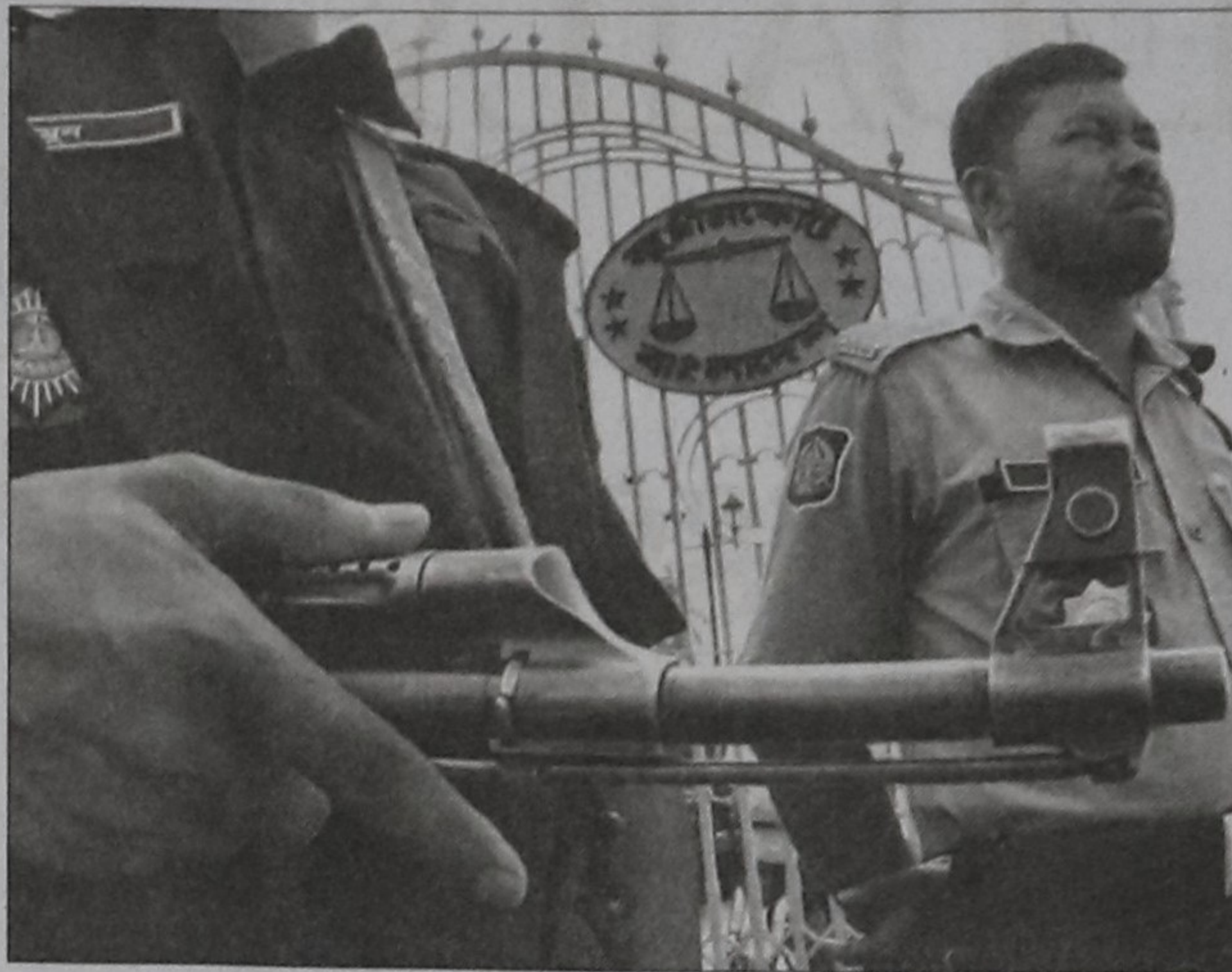
Law enforcers stand guard in front of the main gate of the High Court in the city yesterday as part of beefed-up security.

Asked about the execution of Tuesday's High Court directive to him to stop within 48 hours earth filling and encroachment on the river Turag, the IGP said he is yet to receive the order, but already instructed his forces concerned to take steps out of social responsibility.