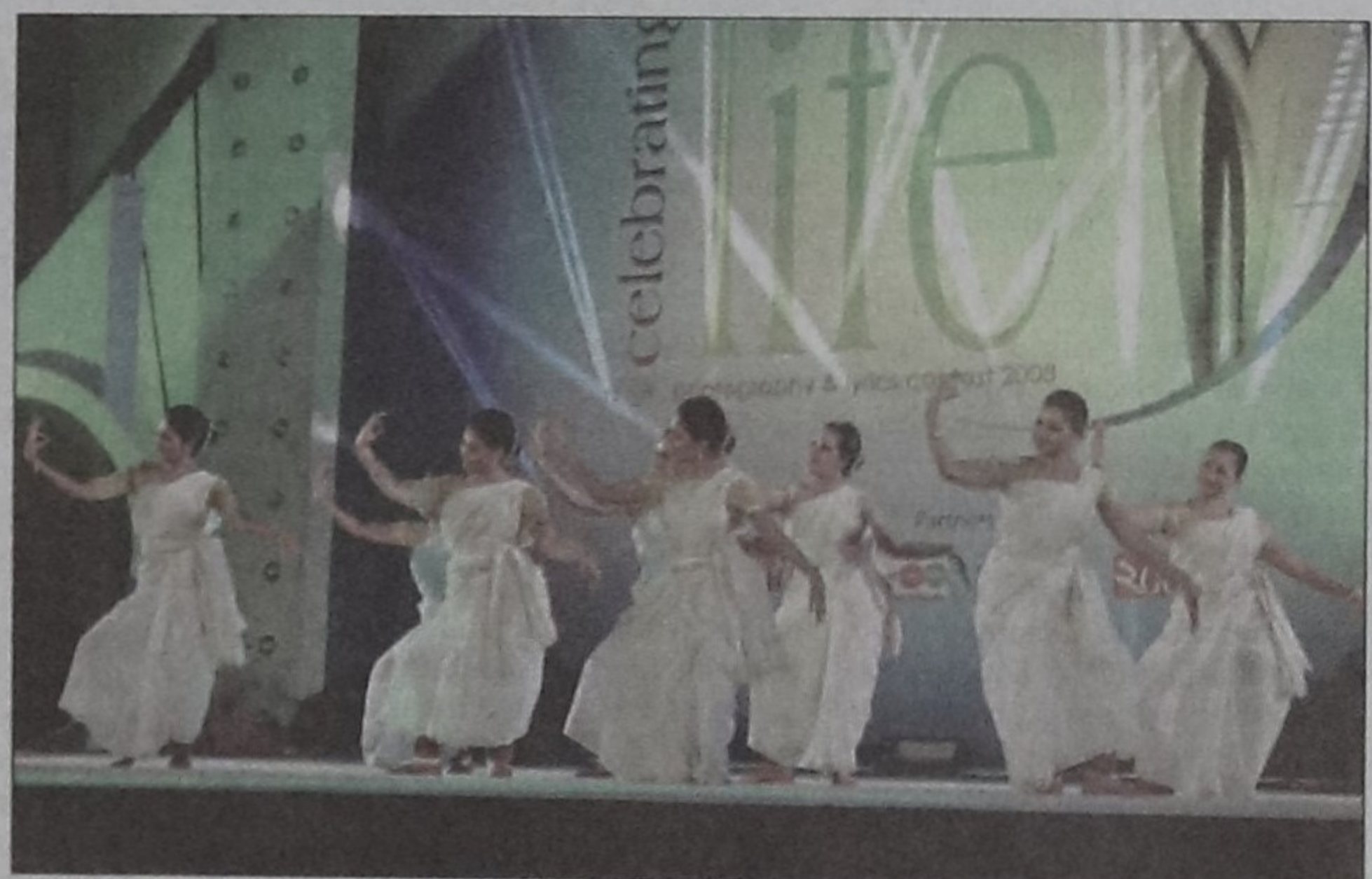
Arranged jointly by The Daily Star and Standard Chartered Bank, "Celebrating Life" is a welcome step forward to encourage undiscovered talents in the country.

response -- in all three categories -- is as good as last year, though the submission in the film section is a little disappointing. "We expected more entries in the