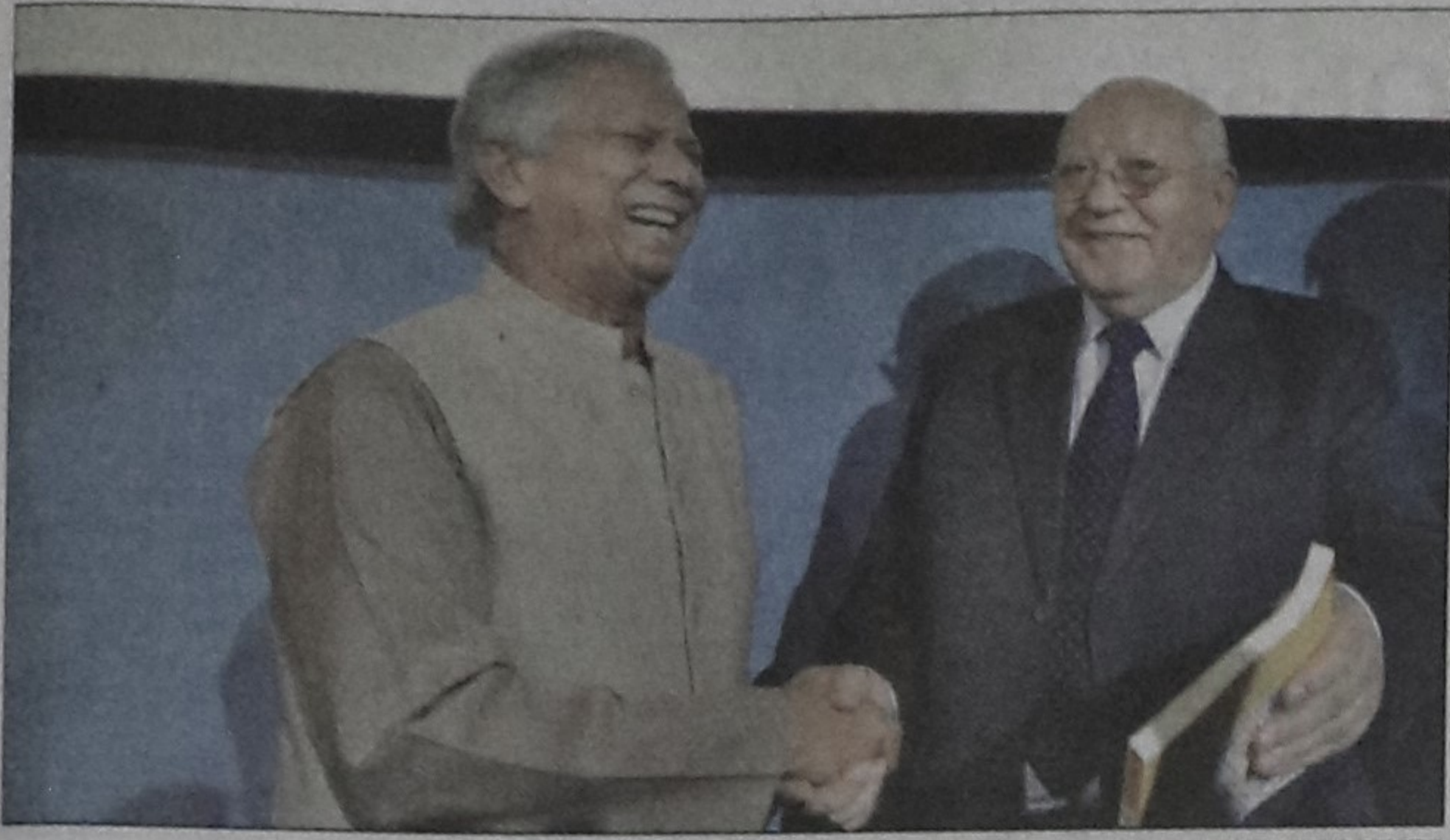
Nobel laureate Prof Muhammad Yunus shakes hands with former Soviet leader Mikhail Gorbachev at a joint press conference in Berlin on Monday, as Germany celebrates the 20th anniversary of the fall of the Berlin Wall.