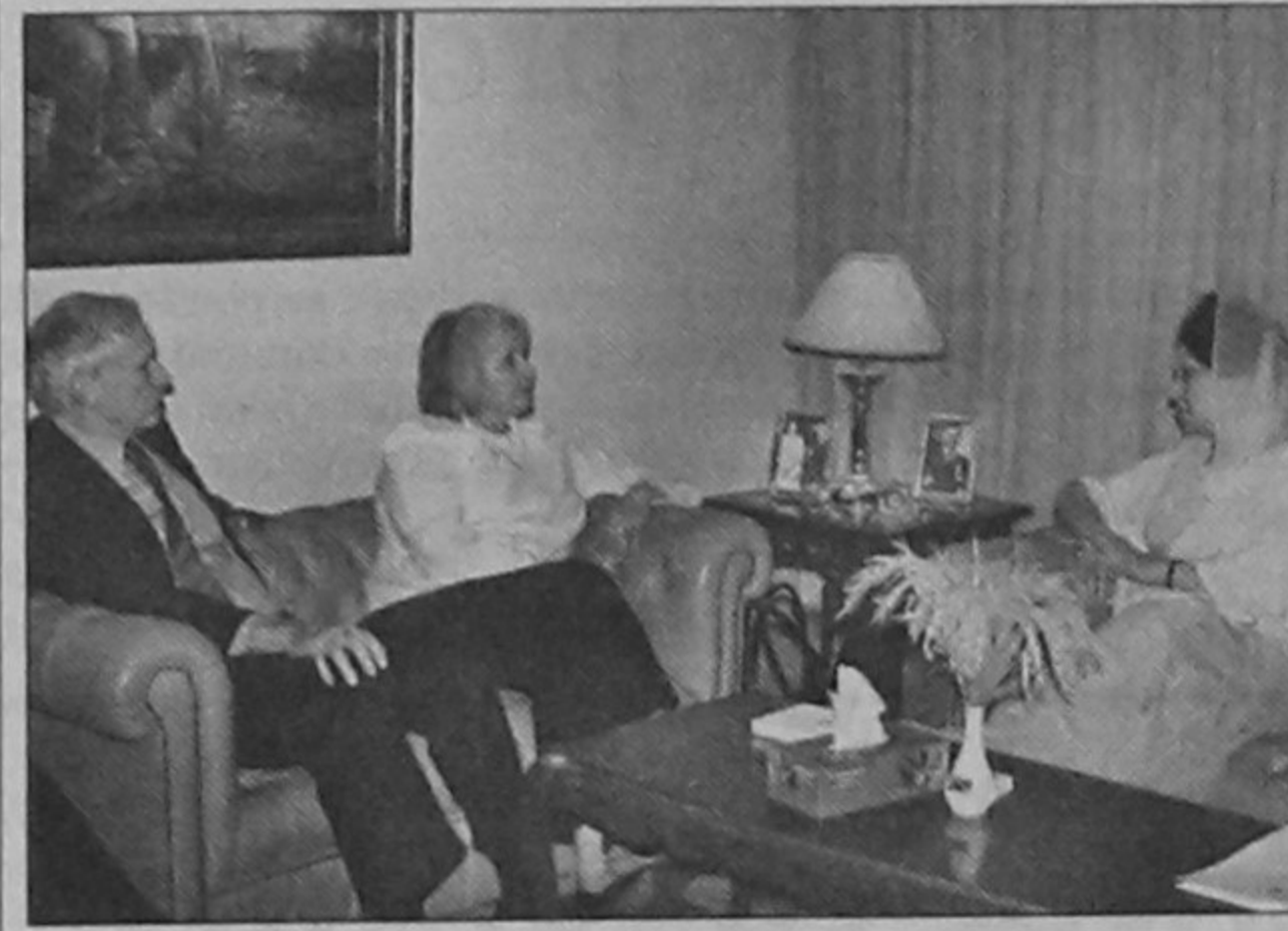
US Ambassador-at-Large for Global Women's Issues Melanne Verwee calls on Leader of the Opposition and BNP Chairperson Khaleda Zia at her Gulshan office in the city yesterday.