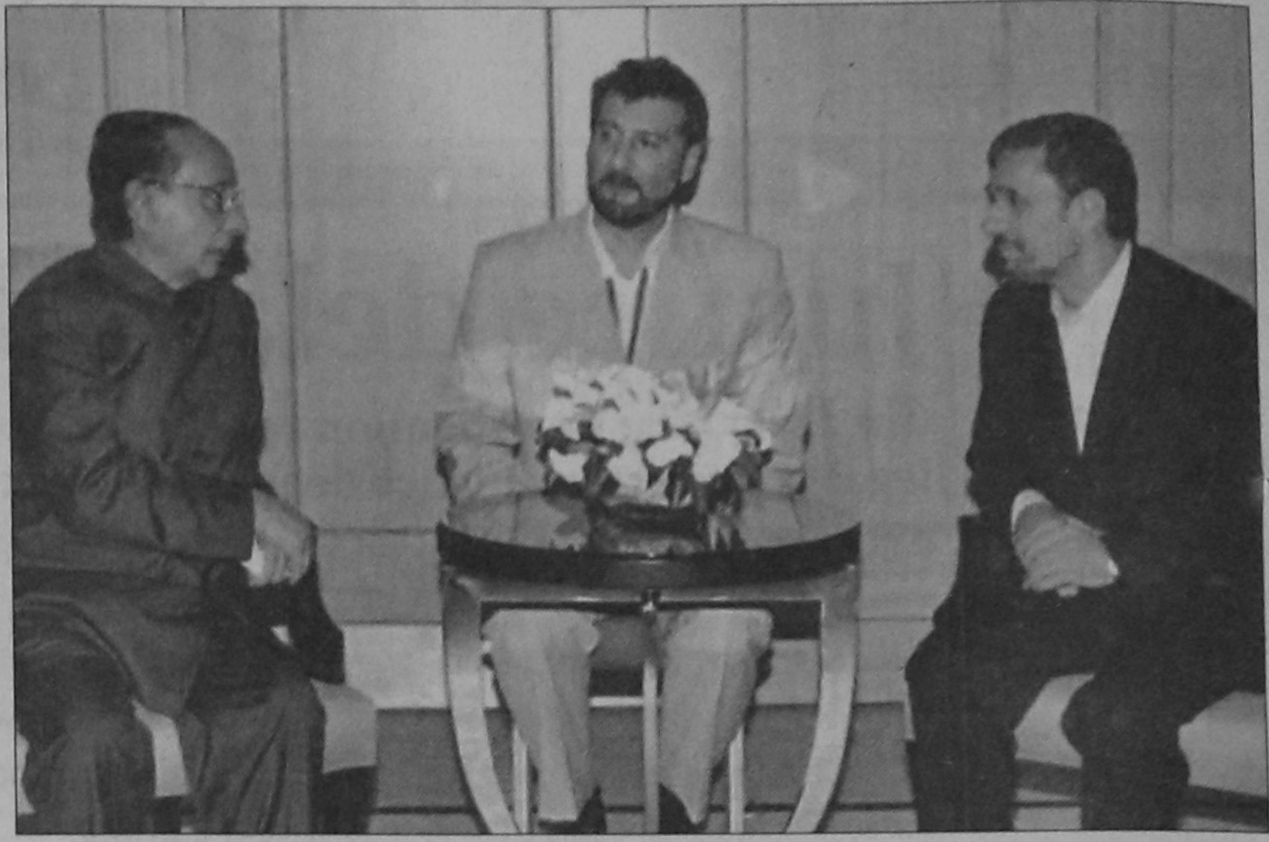
President Zillur Rahman and his Iranian counterpart Dr Mahmoud Ahmadinejad hold talks on the sidelines of the COMCEC economic summit in Istanbul on Monday. (Related Story on B-3)

Terming Bangladesh is a great nation with huge human resources, he hoped that under the leadership of Prime Minister Sheikh Hasina, the country would be able to reach its desired goal soon.