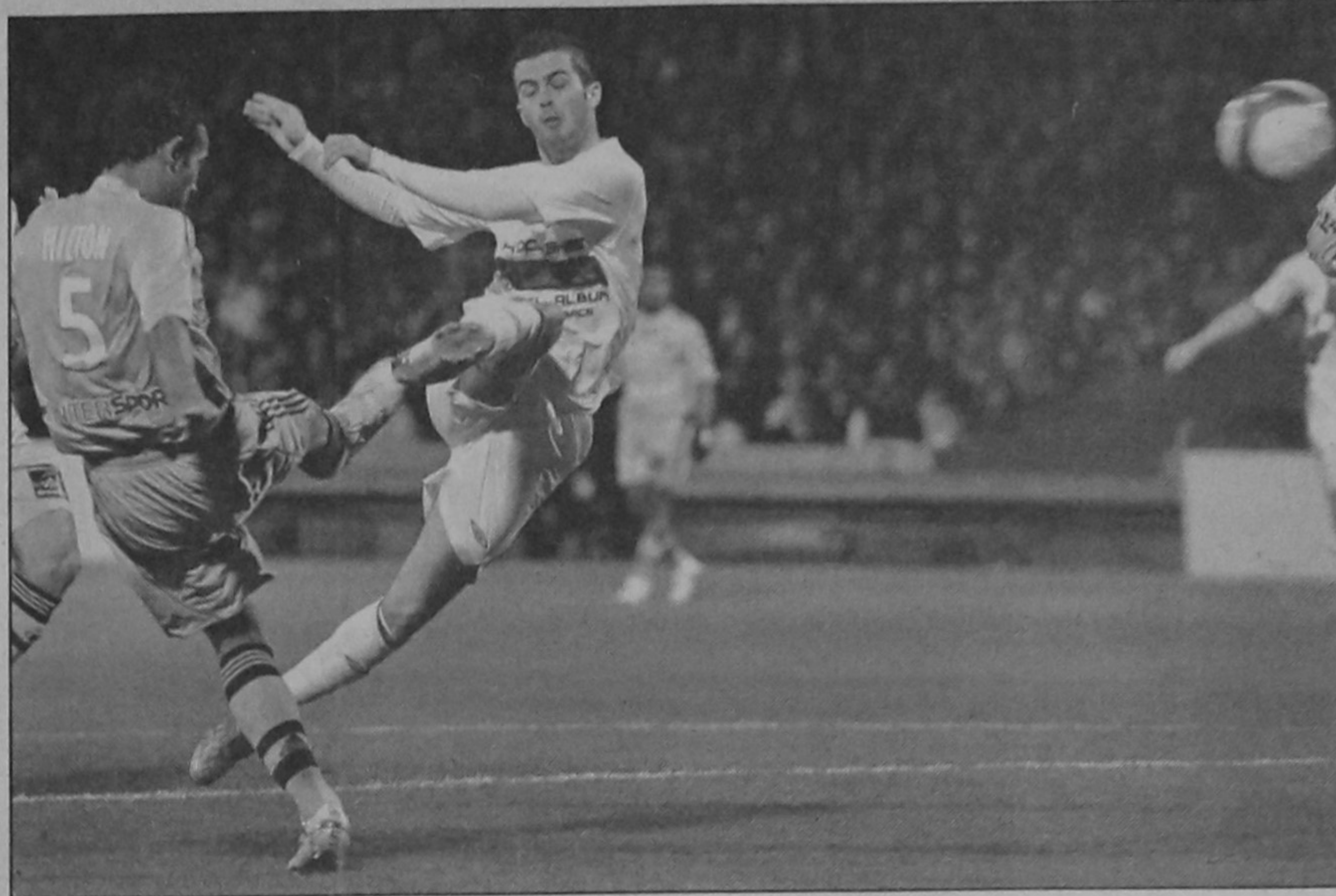
Lyon striker Miralem Pjanic (C) volleys home during their Ligue 1 match against Marseille at the Stade Gerland on Sunday.