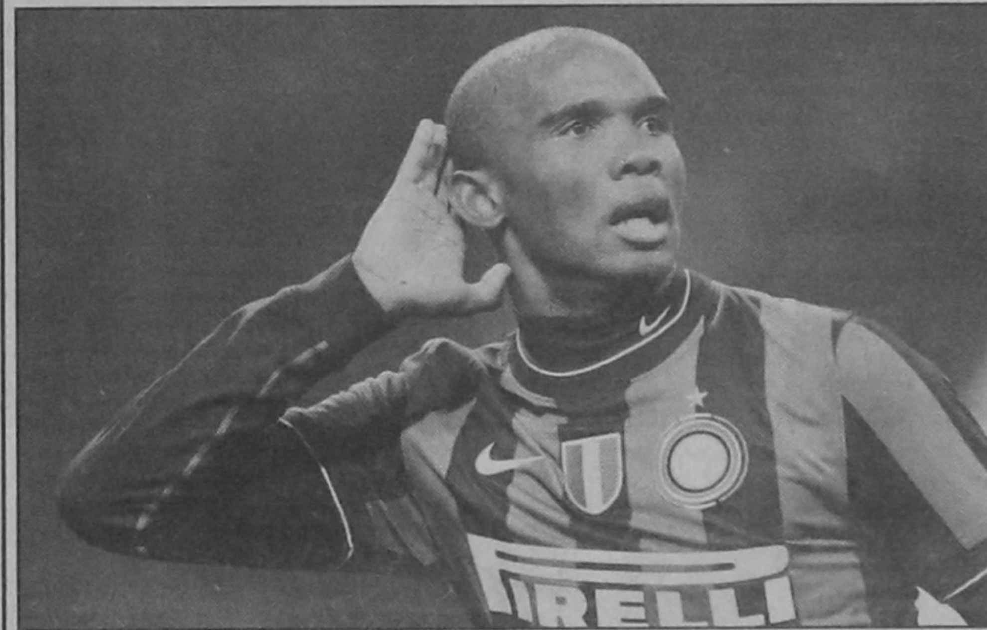
Inter Milan forward Samuel Eto'o mocks the away crowd after scoring during their crunch Serie A clash against AS Roma at the San Siro in Milan on Sunday.