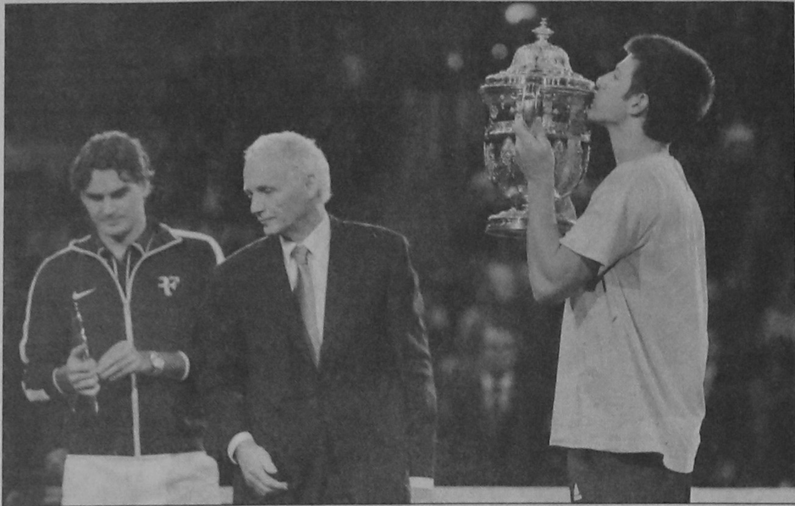
Serbia's Novak Djokovic (R) kisses the Swiss Indoors ATP trophy after defeating world number one Roger Federer (L) of Switzerland in Basel yesterday.

FROM PAGE 17 By that stage, United were looking the more likely winners with Rooney increasingly troubling the home side's back four.