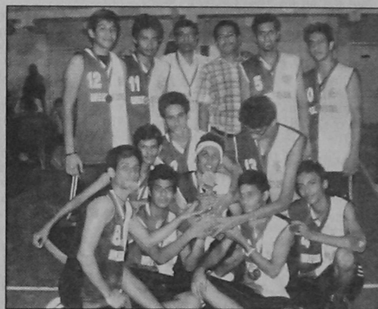
Players of Maple Leaf International School pose with the trophy after beating St. Francis Xavier Green Herald International School in the final of an invitational basketball tournament at the Dhanmondi Gymnasium recently.