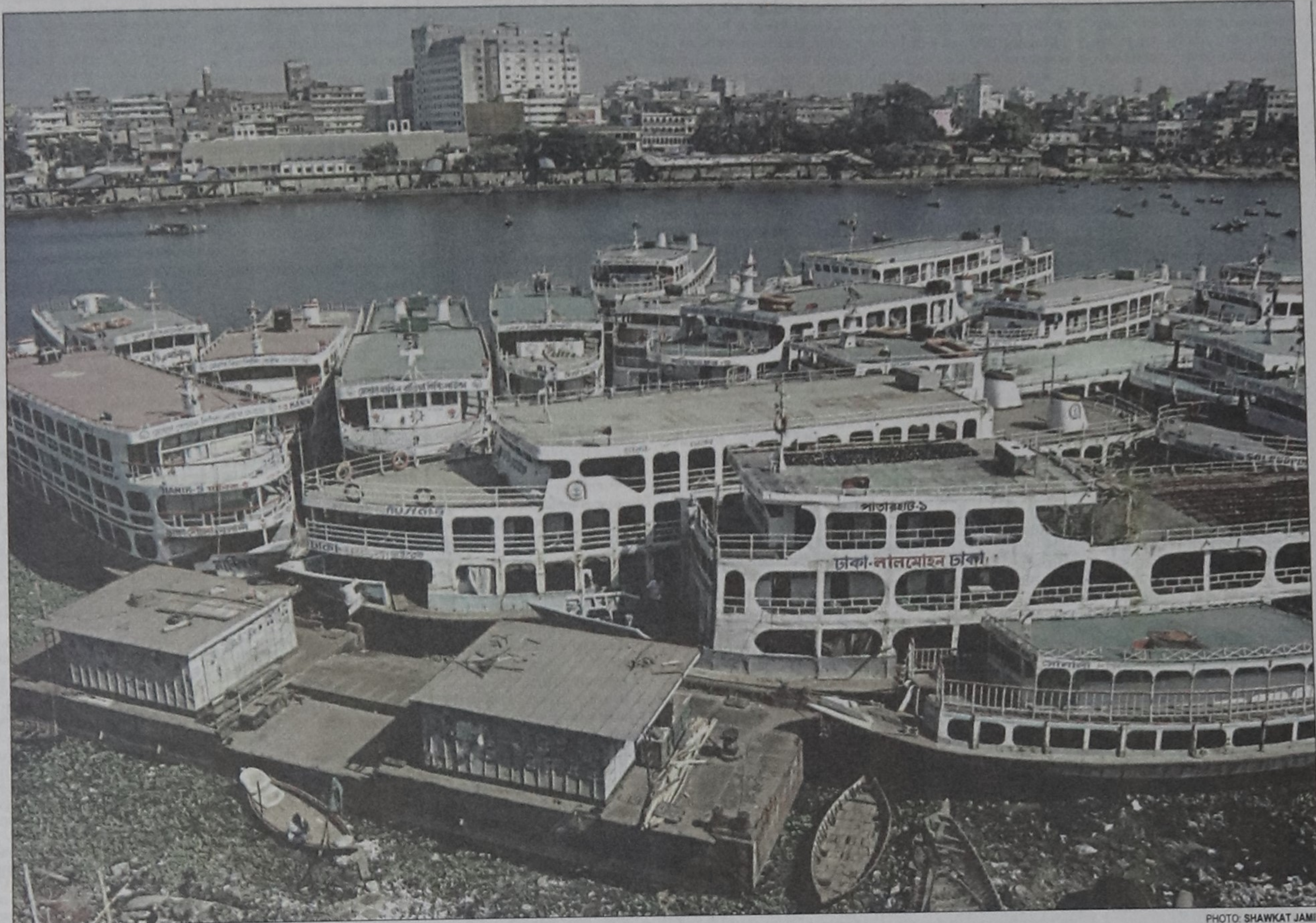
Launches moored in the Buriganga opposite Sadarghat terminal in the capital yesterday as a countrywide water transport strike began Saturday midnight paralysing river communication.