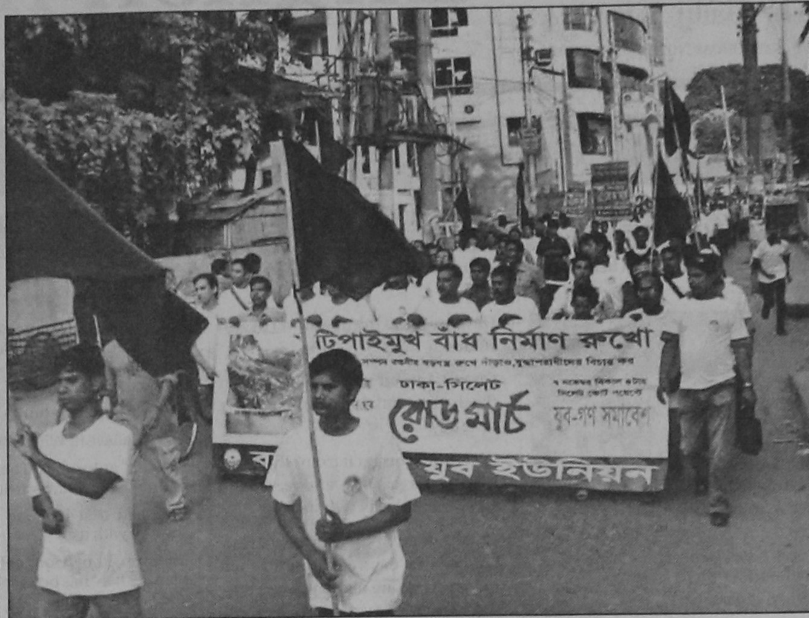
Bangladesh Jubo Union brings out a procession in Sylhet city on Saturday protesting Indian move to build dam at Tipaimukh.