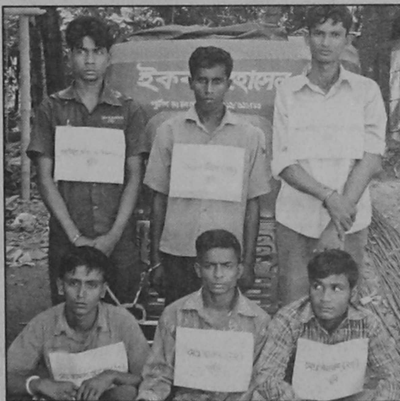
Police arrest six members of a gang involved in stealing CNG-run auto-rickshaws from different places of Chittagong city and district on Saturday.

On or before November 22, 2009. Only applications received by this date will be considered. C-1784