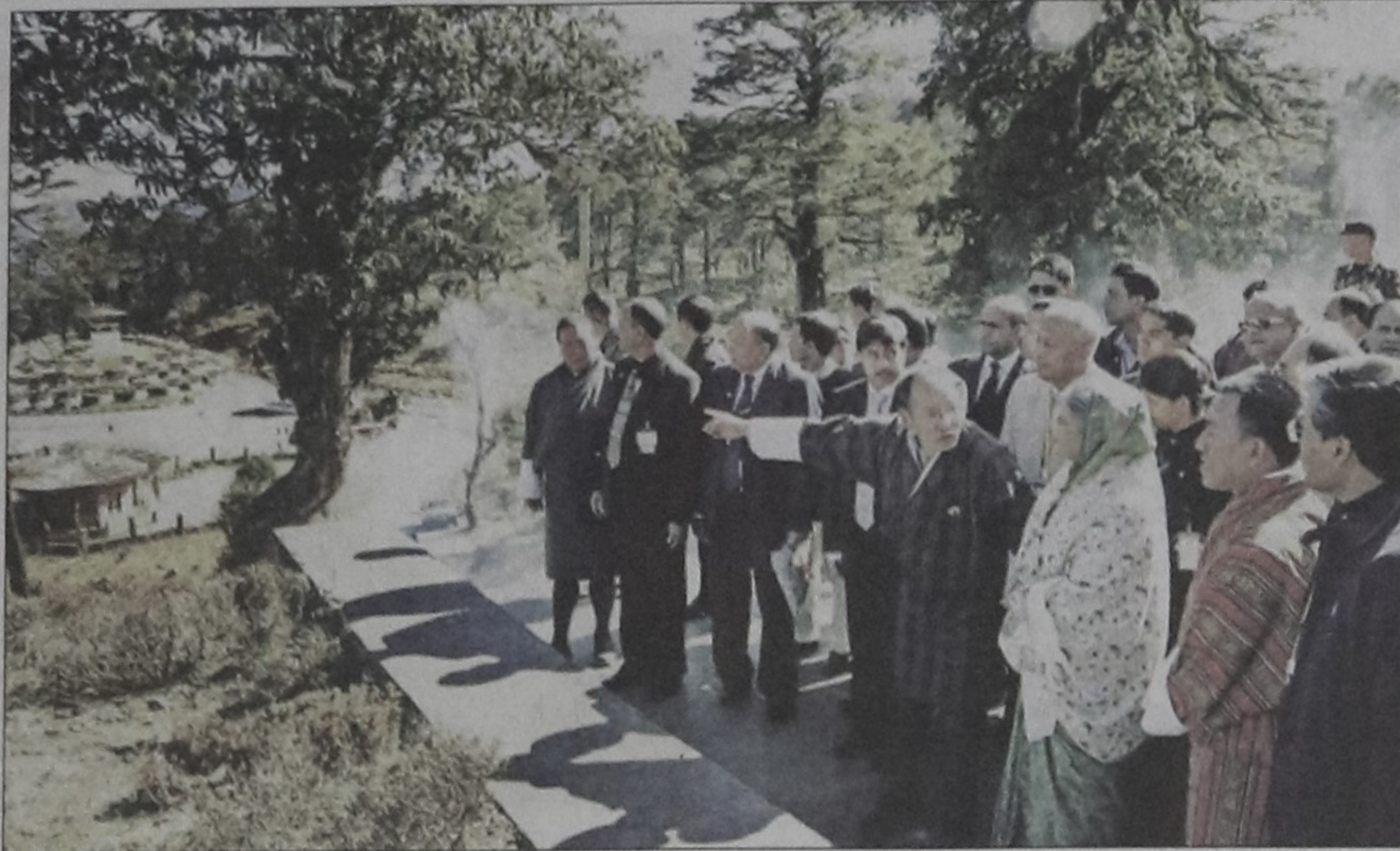
Prime Minister Sheikh Hasina visits a place of historical interest in Bhutan yesterday during her official visit to the landlocked South Asian country.