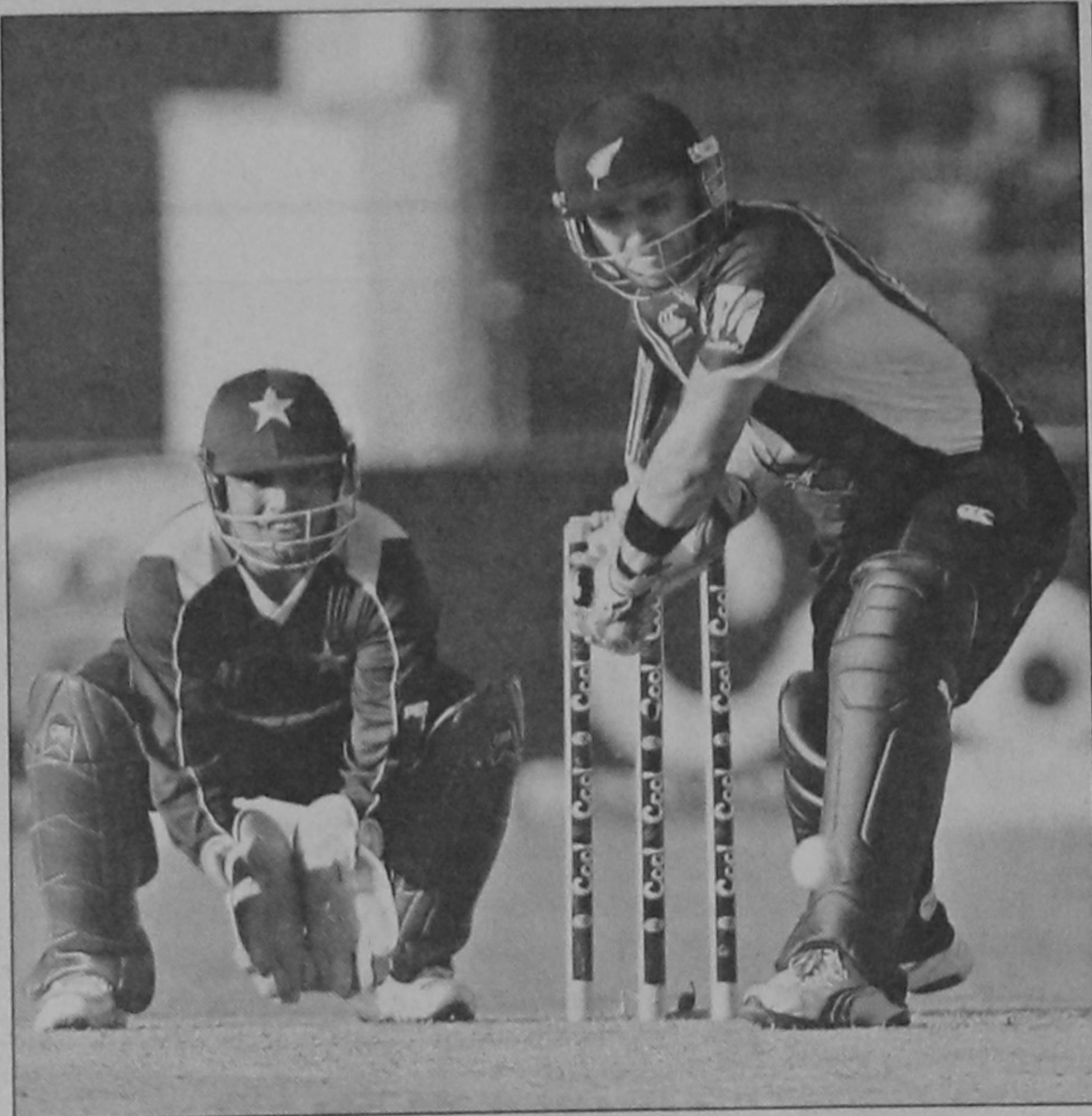
New Zealand's Brendon McCullum is all set to have a go at a delivery during his swashbuckling 131 as Pakistan wicketkeeper Kamran Akmal looks on during the second one-day international at the Abu Dhabi Stadium on Friday.

Premier Div Cricket League Biman v Partex Venue: Fatullah Cricket Stadium Gazi Tank v Kalabagan Venue: Sher-e-Bangla National Cricket Stadium Victoria v Khelaghar Venue: BKSP-2