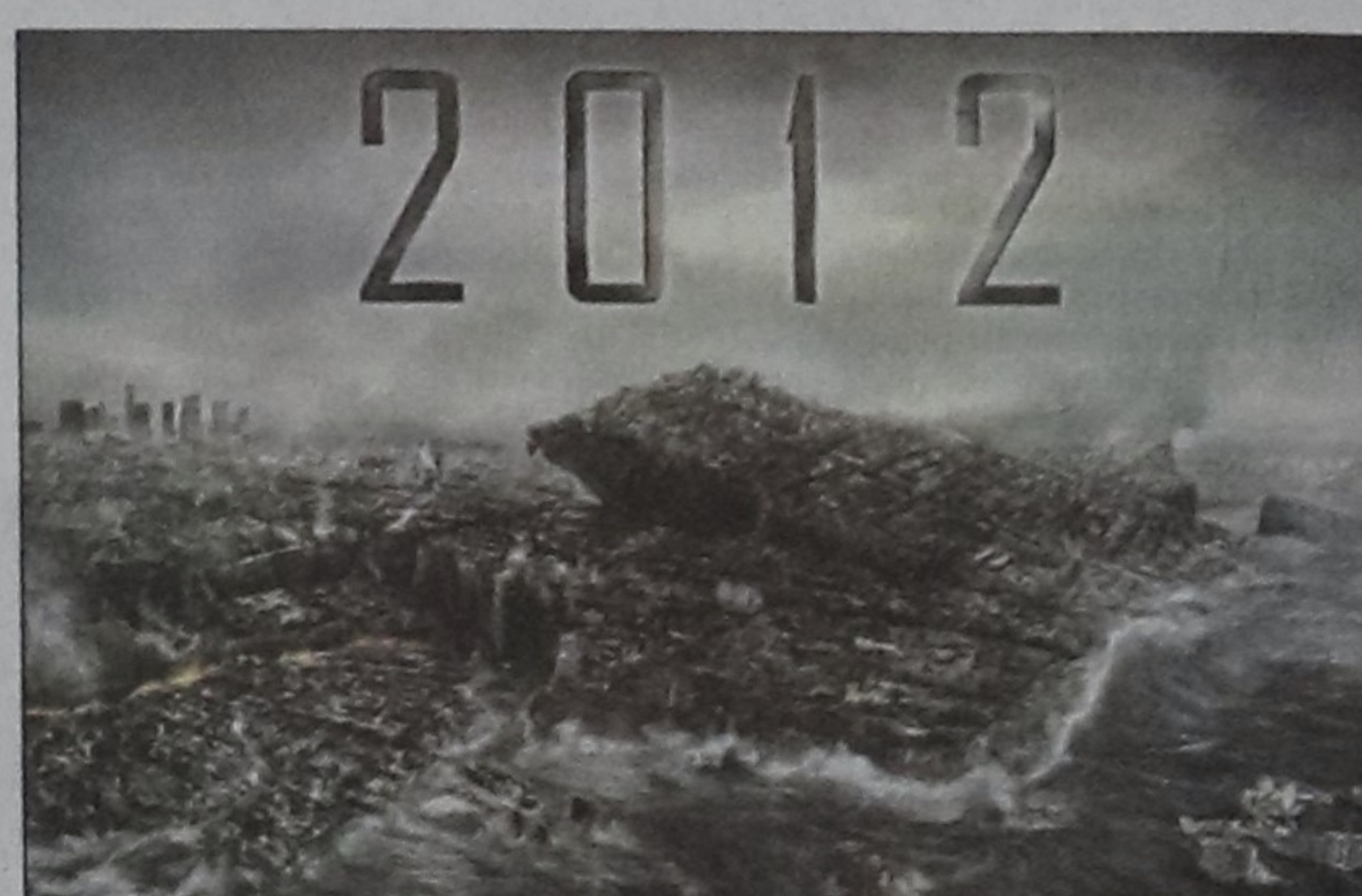
In "2012" landmarks are submerged, scorched or altogether shredded.

Alien invaders, tsunamis and asteroids have crashed into Emmerich's oeuvre since he first blew up the White House in 1996 with a blue death ray, in "Independence Day". (Even the Discovery Channel followed suit with its own doomsday-theme reality series