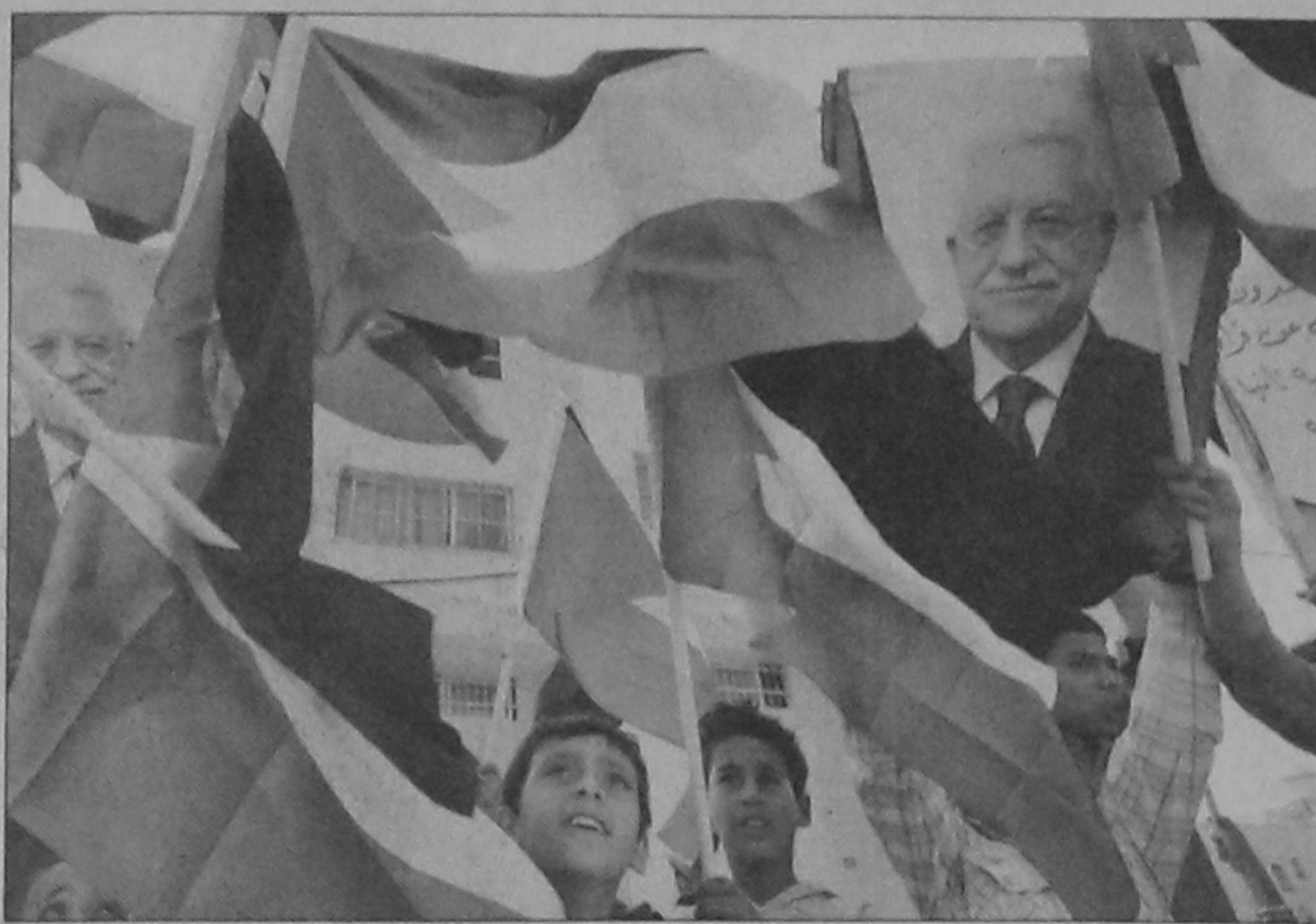
Young Palestinians wave their national flag during a demonstration in support of President Mahmoud Abbas and urging him to seek re-election, in the West Bank city of Jenin yesterday.

The double winner is believed to be a successful businessman from South Africa's Limpopo province.