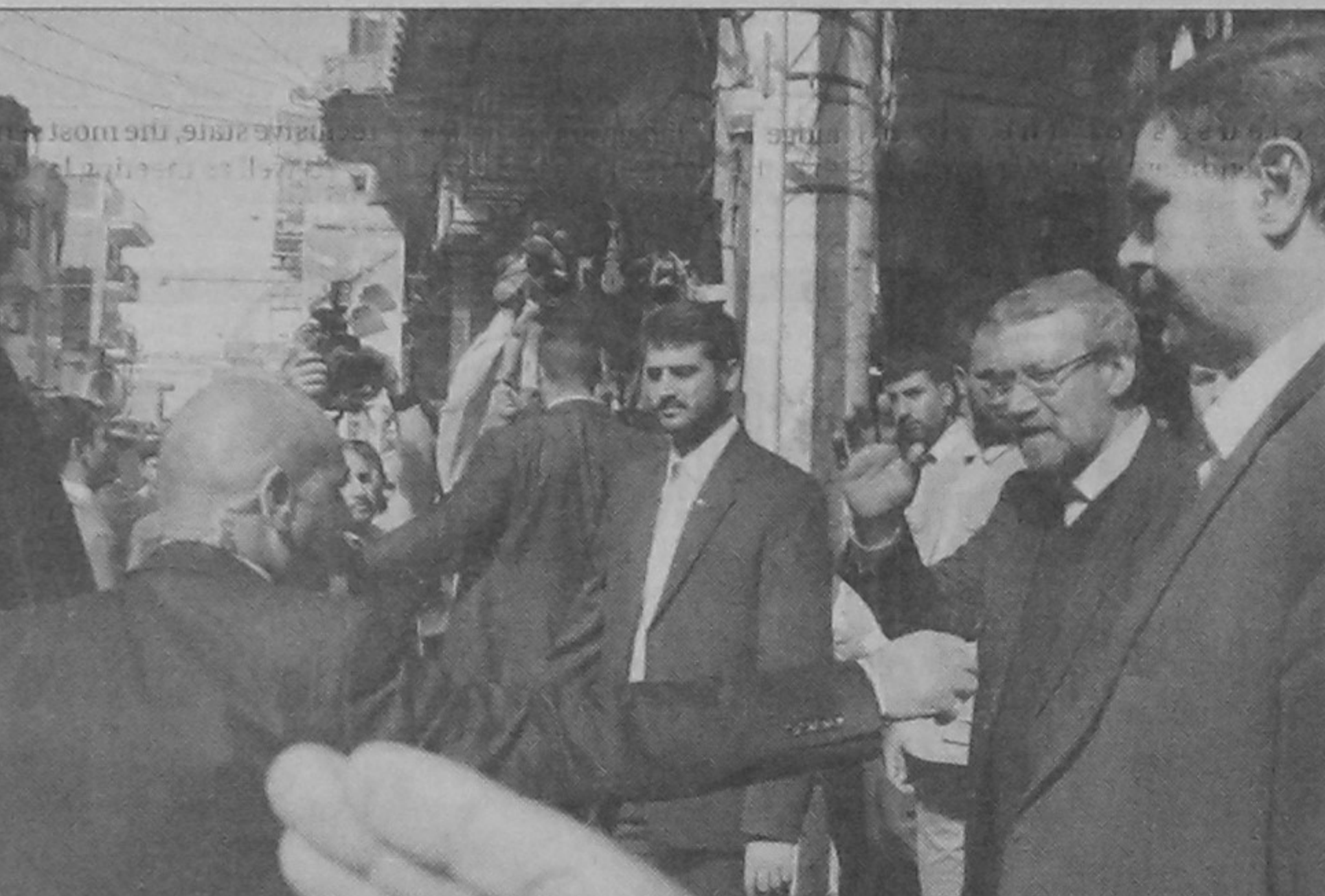
Iran's parliament speaker Ali Larijani (R) waves to the press after meeting with Iraq's top Shia cleric Grand Ayatollah Ali Hussein al-Sistani in the holy city of Najaf, 150km from Baghdad yesterday. Larijani is ending a four-day official visit to Iraq.

During his long career, he also conducted high-profile probes of the Rwandan genocide, the 2004 Madrid attacks and the 1995 Paris subway bombings carried out by Algerian militants.