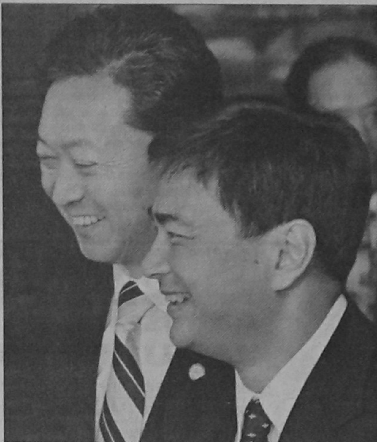
Thai Prime Minister Abhisit Vejjajiva (R) walks with his Japanese counterpart Yukio Hatoyama prior to their meeting in Tokyo yesterday. The leaders of Japan and Southeast Asia's five Mekong River nations wrapped up a summit at which Tokyo pledged more than 5.5 billion USD in loans and grants and vowed deeper ties.

Palestinian exasperation with President Barack Obama is running high. He began his term by reaching out to Muslims and promising zero tolerance for new Israeli settlement construction. The Obama team has since shifted stance, and many Palestinians believe their leader was simply hung out to dry.