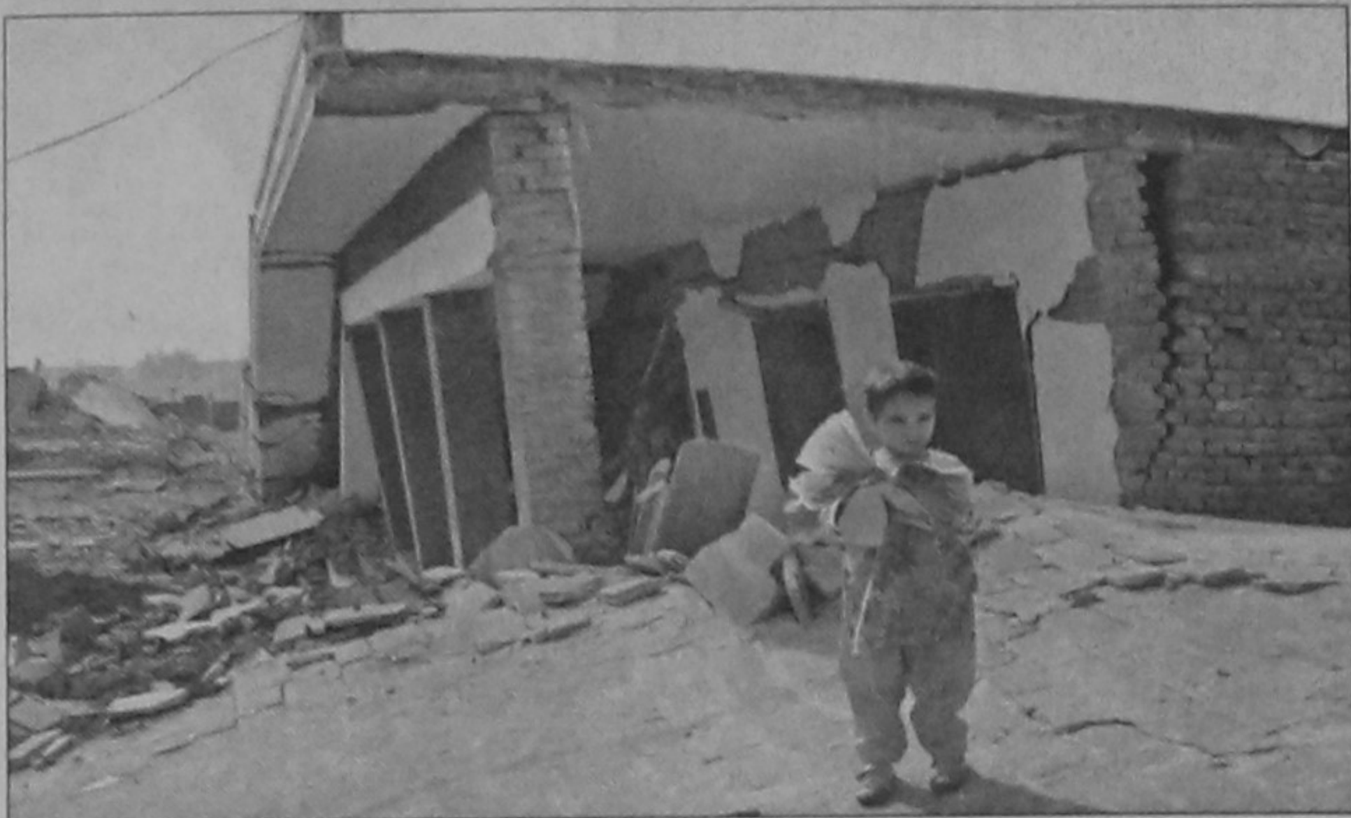
A young girl stands beside the rubble of a school building destroyed by militants on the outskirts of Bara town on Thursday. Taliban militants blew up the girls' school in Pakistan's Khyber district on Nov 5, the second such attack in the lawless region on the Afghan border in four days.

"But it was Thursday, and Thursday was my sauna day so that's where I went -- in the same communist high-rise where we always went."