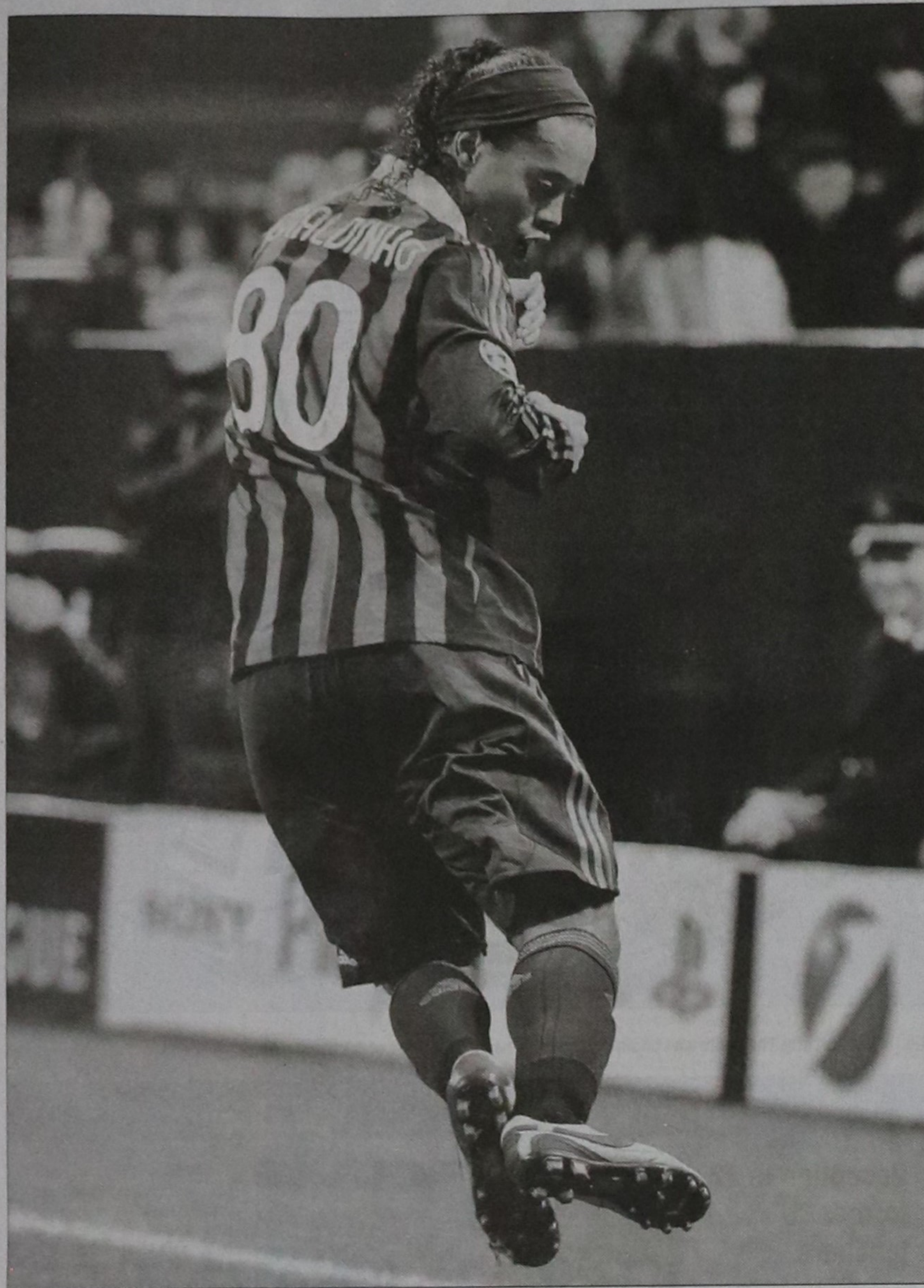
Milan forward Ronaldinho performs samba after scoring the equalising goal from a penalty during their Champions League encounter against Real Madrid at San Siro on Tuesday.