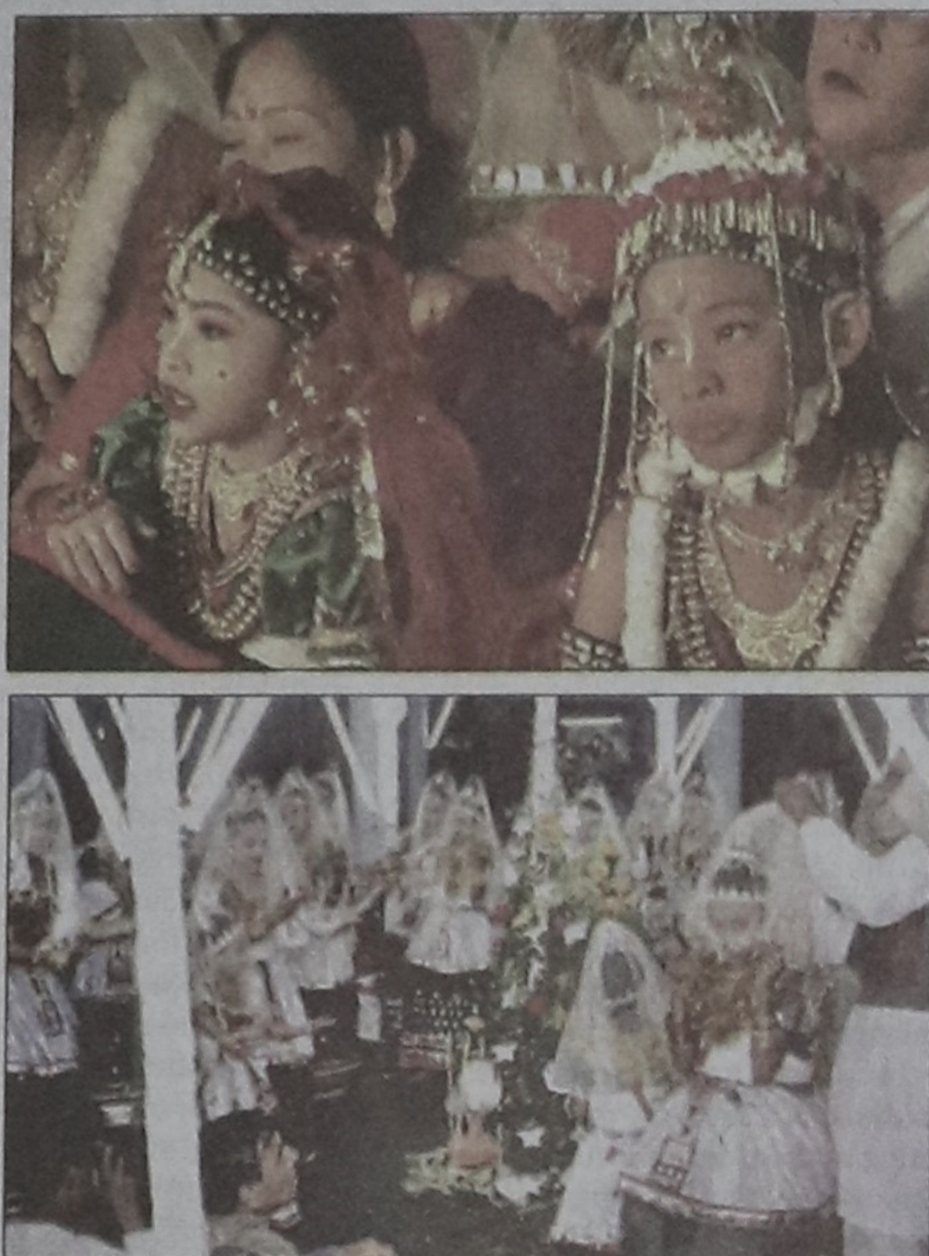
The 'Maha Raas Leela' festival includes 'Gustha leela', 'Raas Nritya' and 'Kirtan'.