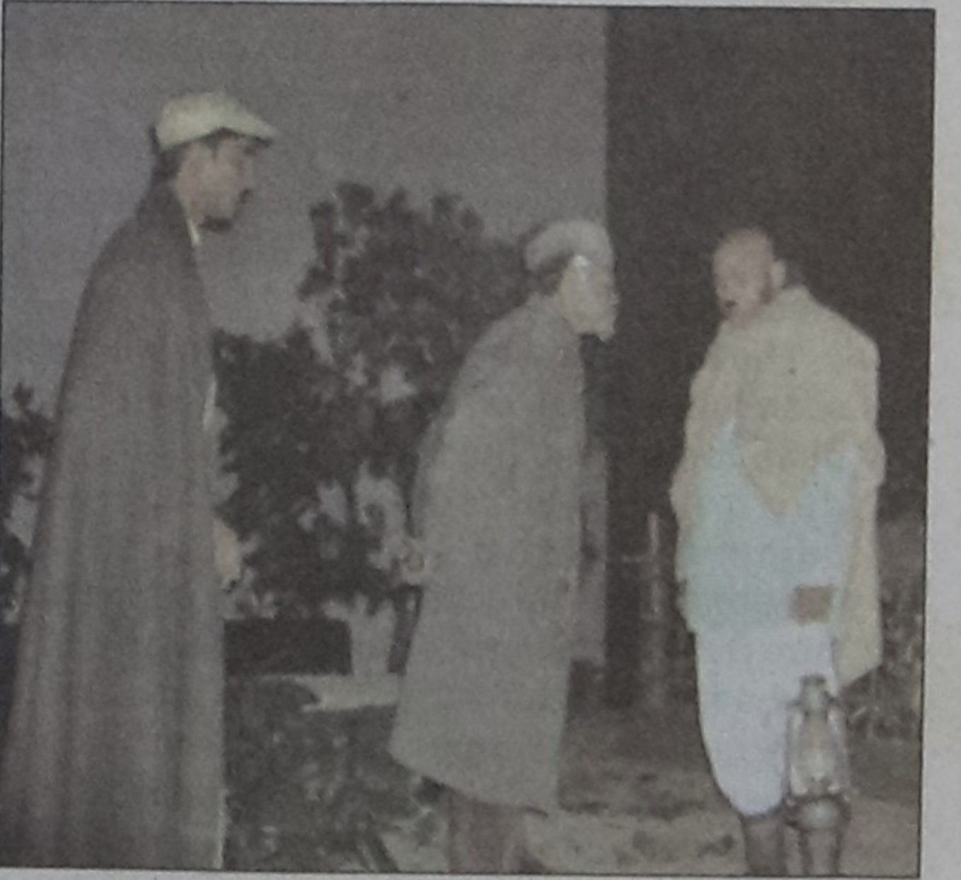
A scene from Thakurgaon Shilpakala Academy's production "Kabor".

major tool in the transformation of society and can create awareness about many social ills. The public and the cultural activists all have responsibility in this direction, they went on to add. With true commitment, they concluded, we would be able to bring about a social change.