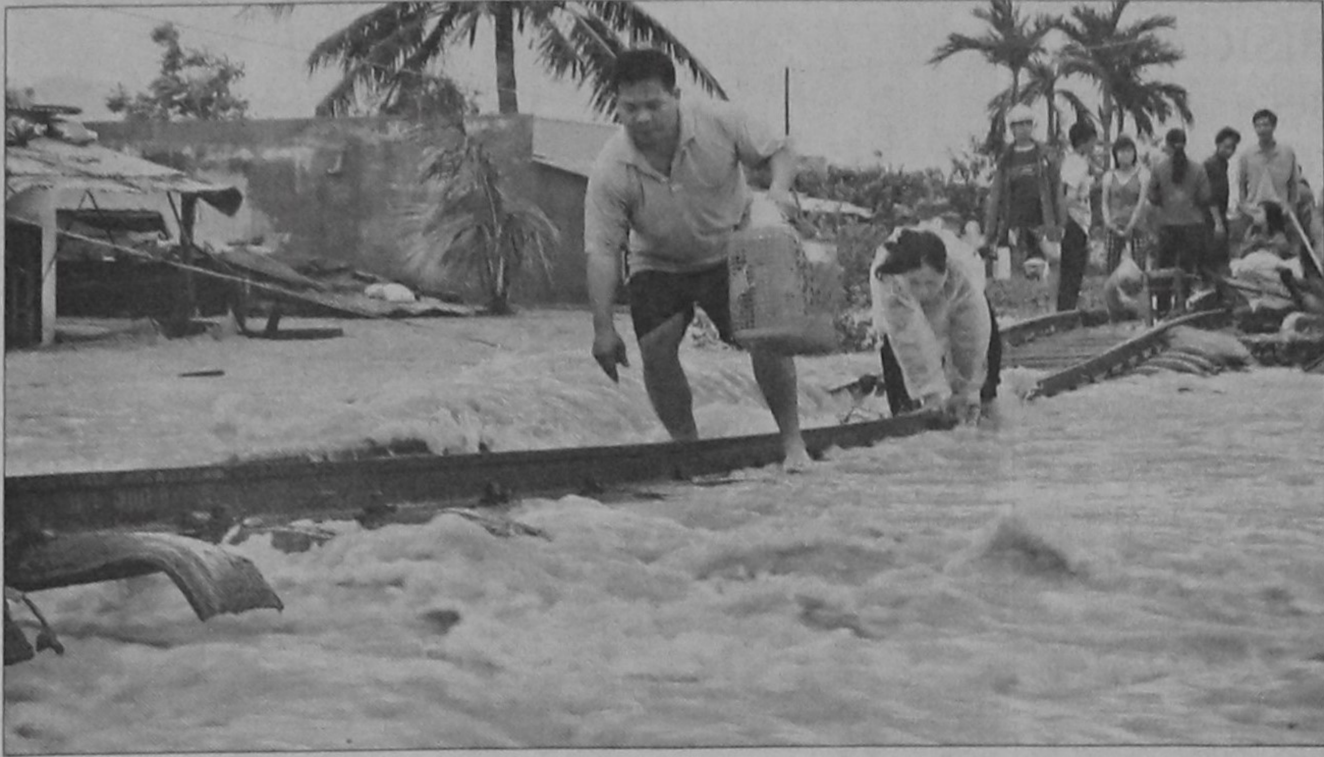
People negotiate a flooded railway track in the central Vietnamese province of Binh Dinh on Monday after the passage of tropical storm Mirinae, which has killed at least 40 people and left two missing after slamming into coastal central Vietnam.