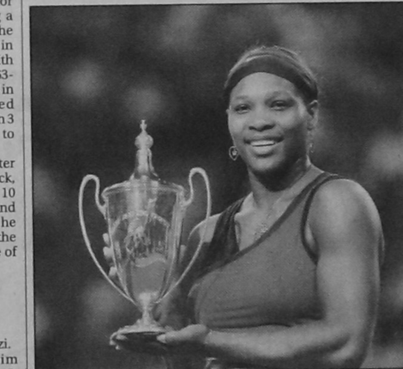
American Serena Williams poses with the winner's trophy after beating her sister Venus in the Qatar Open final in Doha on Sunday.

Victoria Azarenka was also unable to complete a match, handing victory to Agnieszka Radwanska, who had herself started the week as the second alternate but replaced Zvonareva who had moved into the draw instead of Safina.