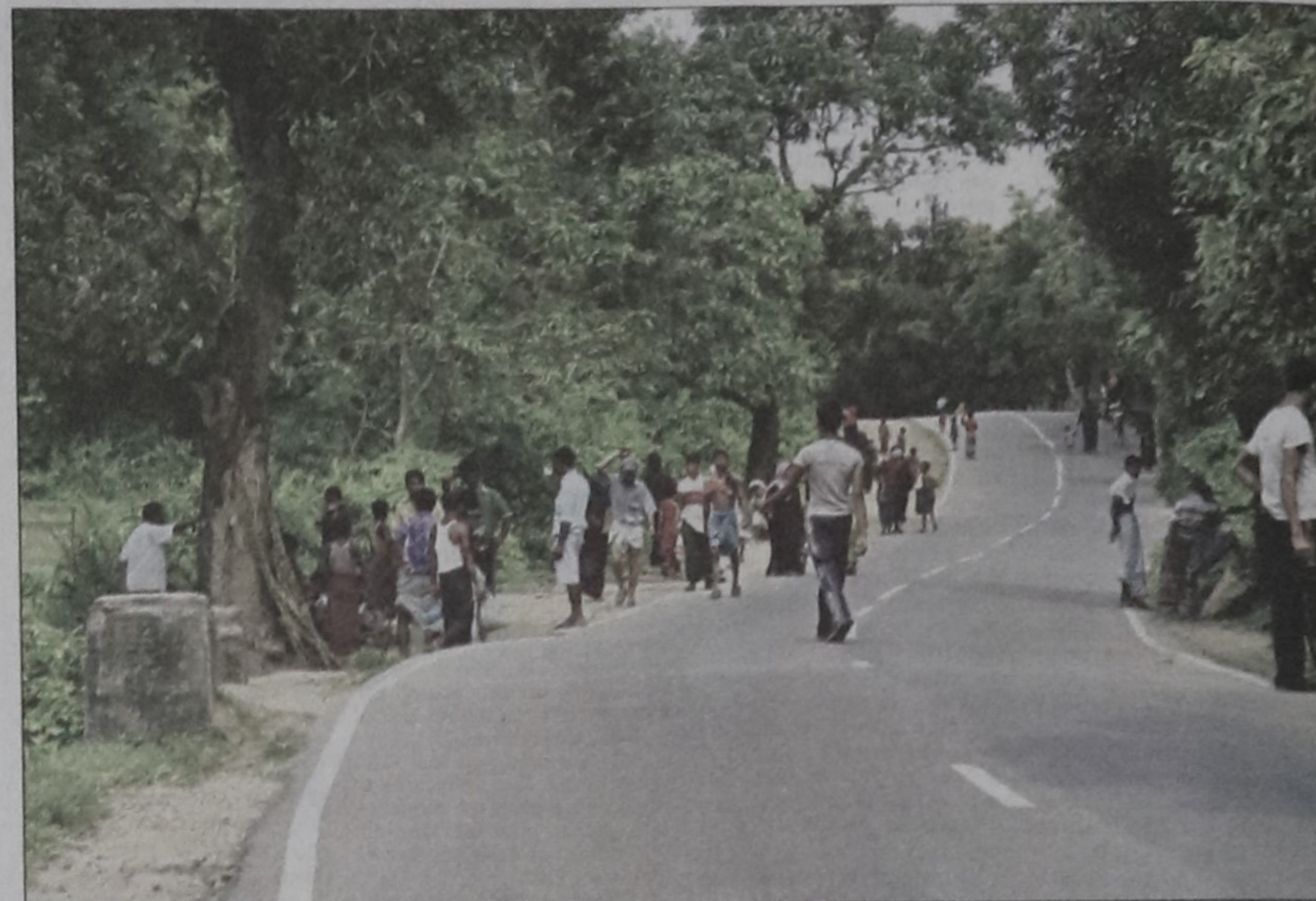
Out of their designated camp, Rohingya refugees are seen on a road at Kutupalong in Ukhiya upazila of Cox's Bazar. Rohingyas are now migrating as workers to different countries, which may thwart government efforts to repatriate them.