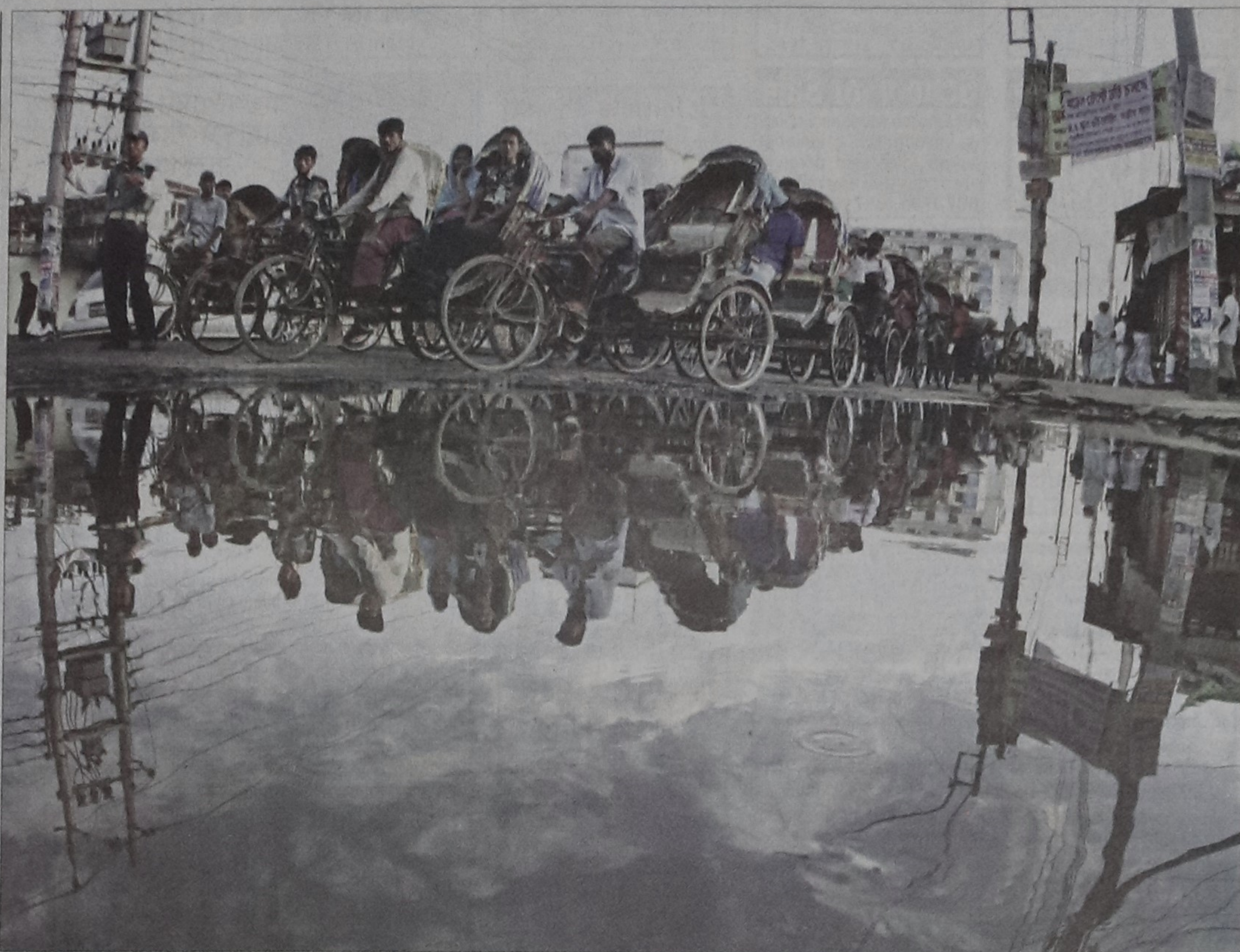
Rickshawpullers negotiate a large pothole on the Mazar Road at Mirpur in the city yesterday. The road has been in a dilapidated condition for long, but the authorities appear to have turned a blind eye.