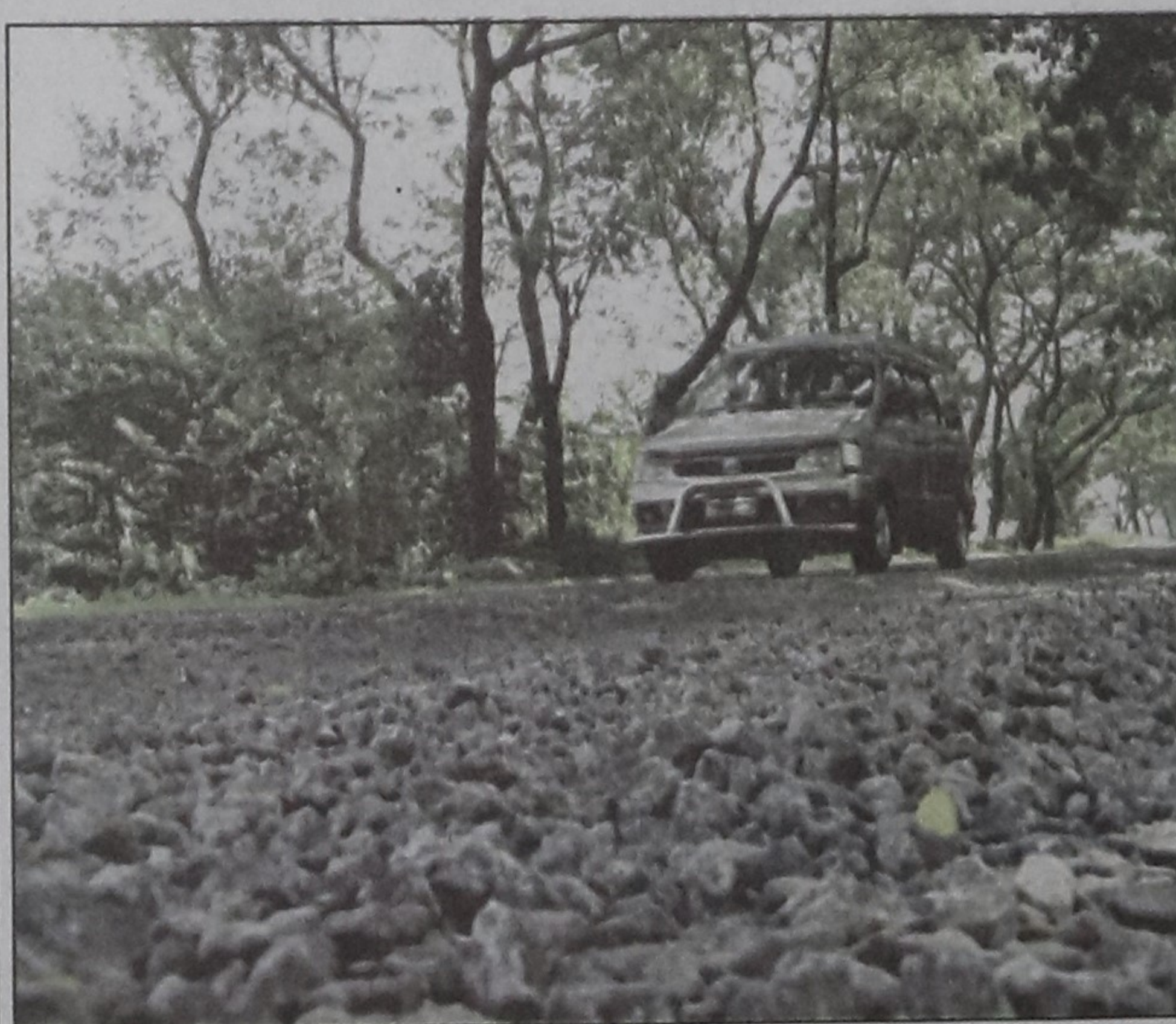
Repaired only about a week ago by the Roads and Highways Department, this portion of Dhaka-Aricha Road at Joypara in Dhamrai upazila has gone back to square one.