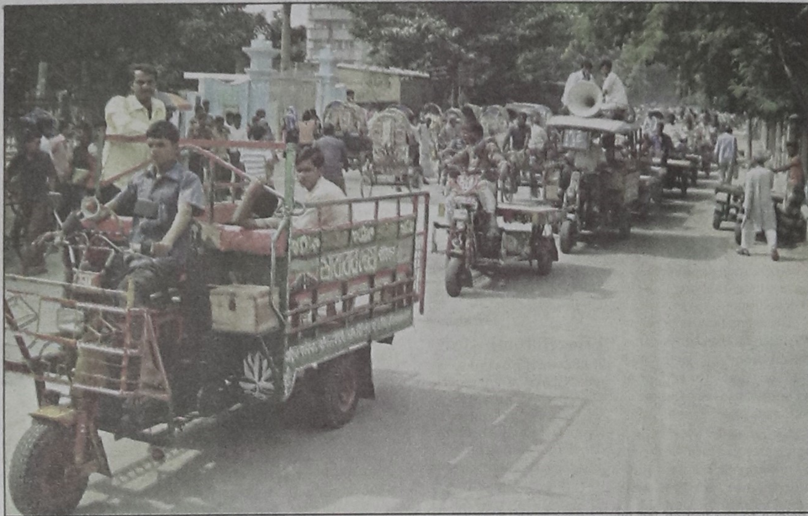
Drivers and owners of locally designed vehicles Nasimon, Karimon and Bhotbhoti join a procession organised by locals in Chapainawabganj town yesterday to press home their demand for stopping 'conspiracy' against plying of the vehicles and BRTC buses in the district.