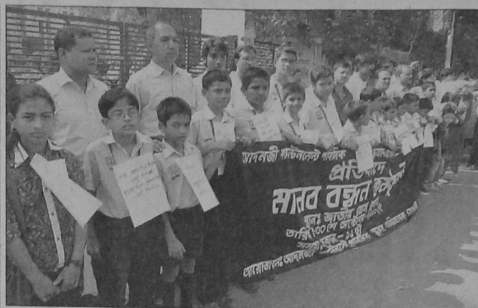
Students of Adamjee Cantonment Public School and their guardians form a human chain in front of the National Press Club in the city yesterday protesting hike of fees at the school.

A member of Bangladesh Ship Breakers Association, on condition of anonymity, said the yard owners are conscious about preservation of the environment and protection of labour rights.