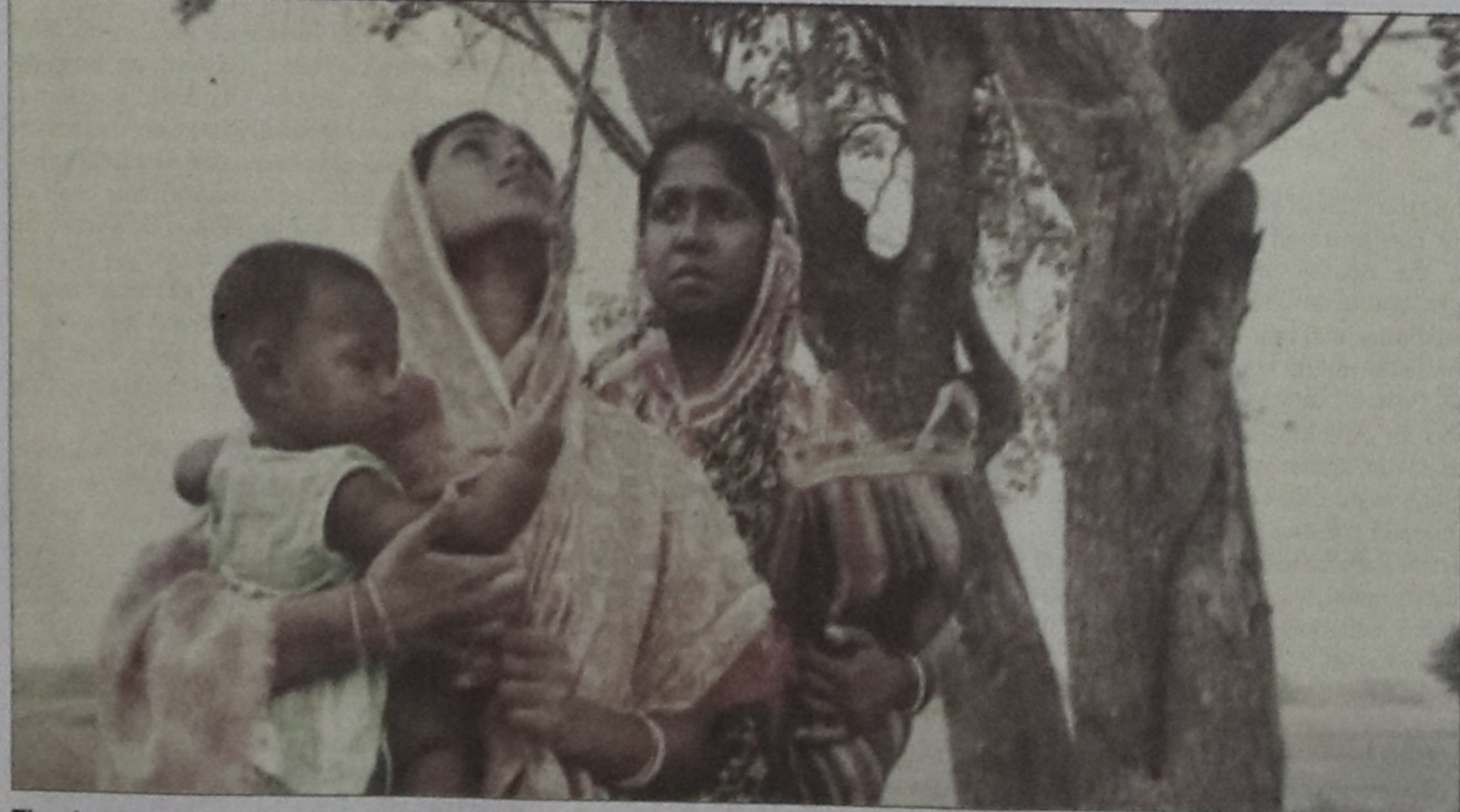
The docu-drama presents three real life stories of women lured away from home, abducted for trafficking and exploitation.