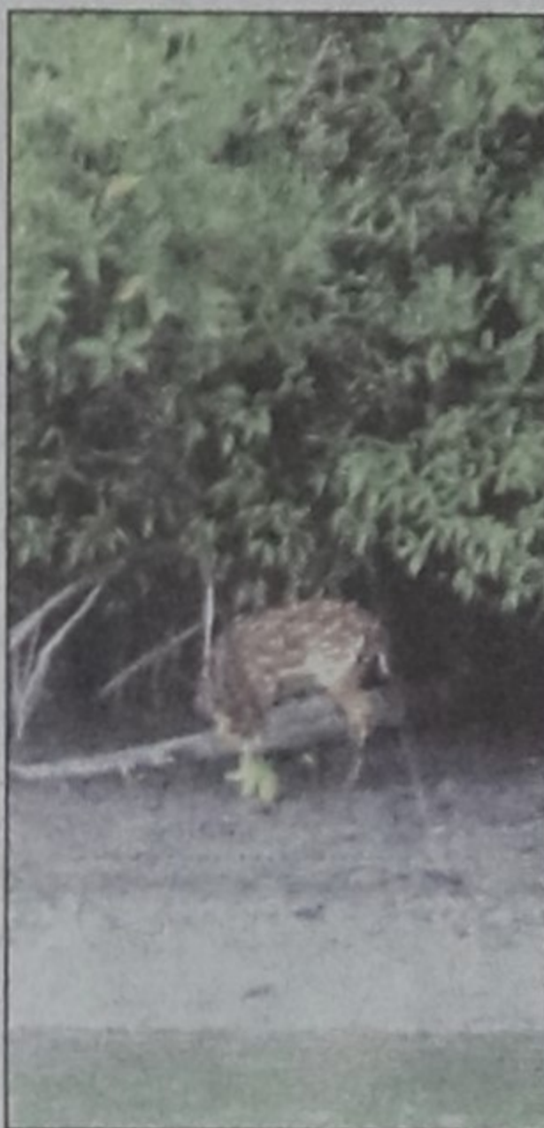
The documentary features life in the Sundarbans.

The 57-minute film provides a look into life in the Sundarbans. Step Towards Development and Rupantar have jointly produced the documentary. "Badabon-er Kotha" is the first Bangladeshi film to compete in the festival.