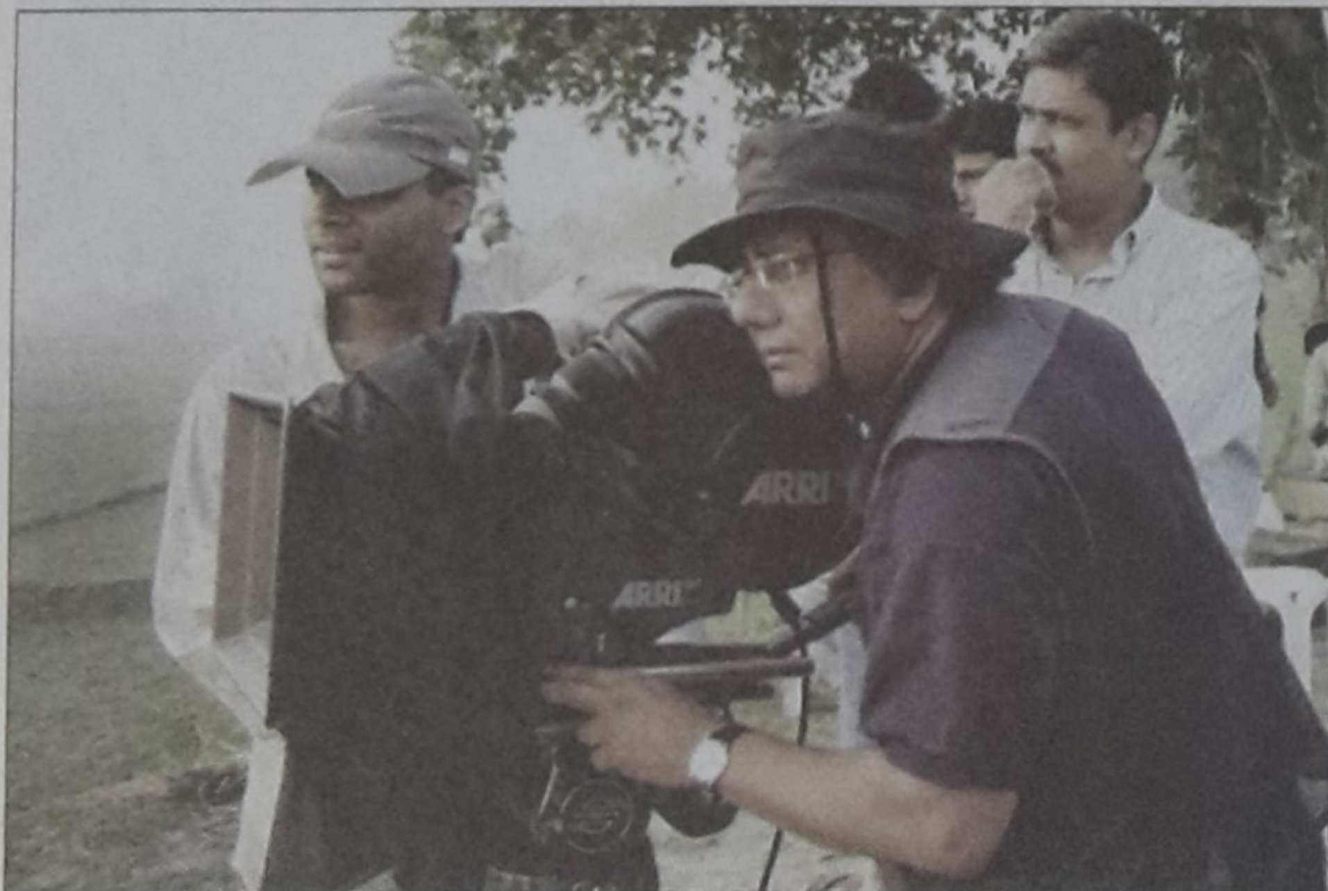
Tanvir Mokammel has made several films on Liberation War.