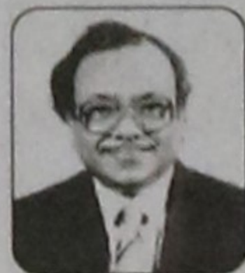
Dr. A. F. M. Ruhul Haque MP Minister Ministry of Health and Family Welfare Govt. of the People's Republic of Bangladesh

I am delighted to know that Orion Infusion Limited has been successful in manufacturing for the first time in Bangladesh a very hi-tech drug, 6% Hydroxyethyl Starch Solution, named "PLASMASOL". This infusion solution will be used for the patients who are in severe hemorrhagic condition. I do congratulate Orion Infusion Limited for achieving this success.