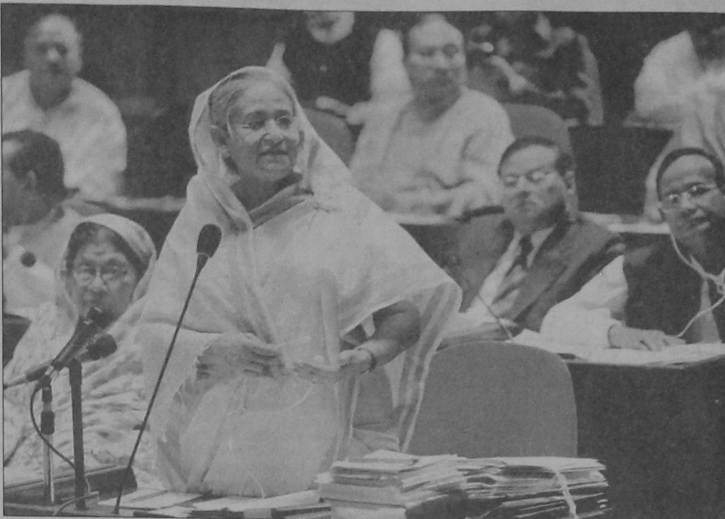
Prime Minister and Leader of the House Sheikh Hasina speaks at the Jatiya Sangsad yesterday. (Story on Page 1)