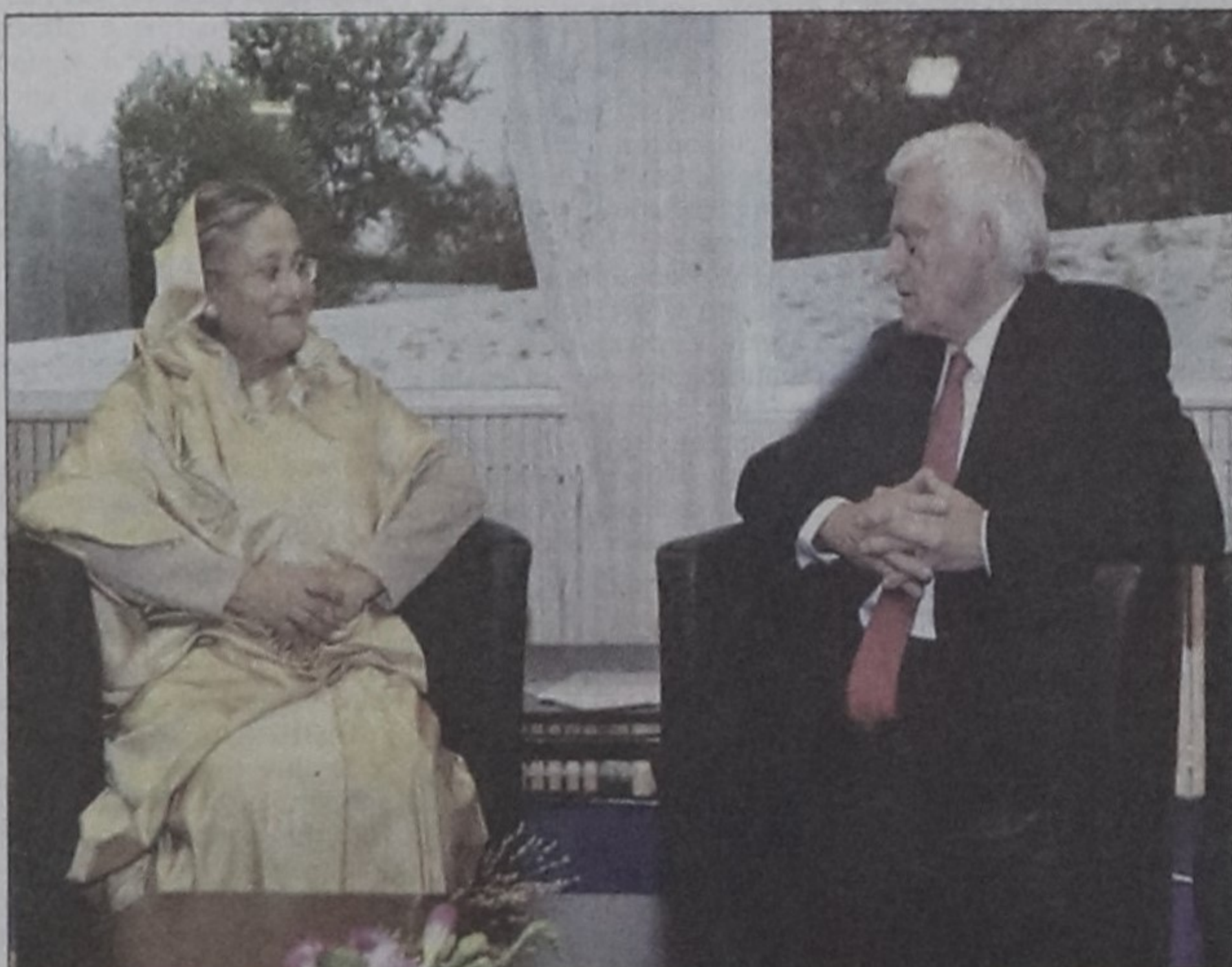
Prime Minister Sheikh Hasina Friday meets European Parliament President Jerzy Buzek during her visit to Stockholm to attend the European Development Days 2009.