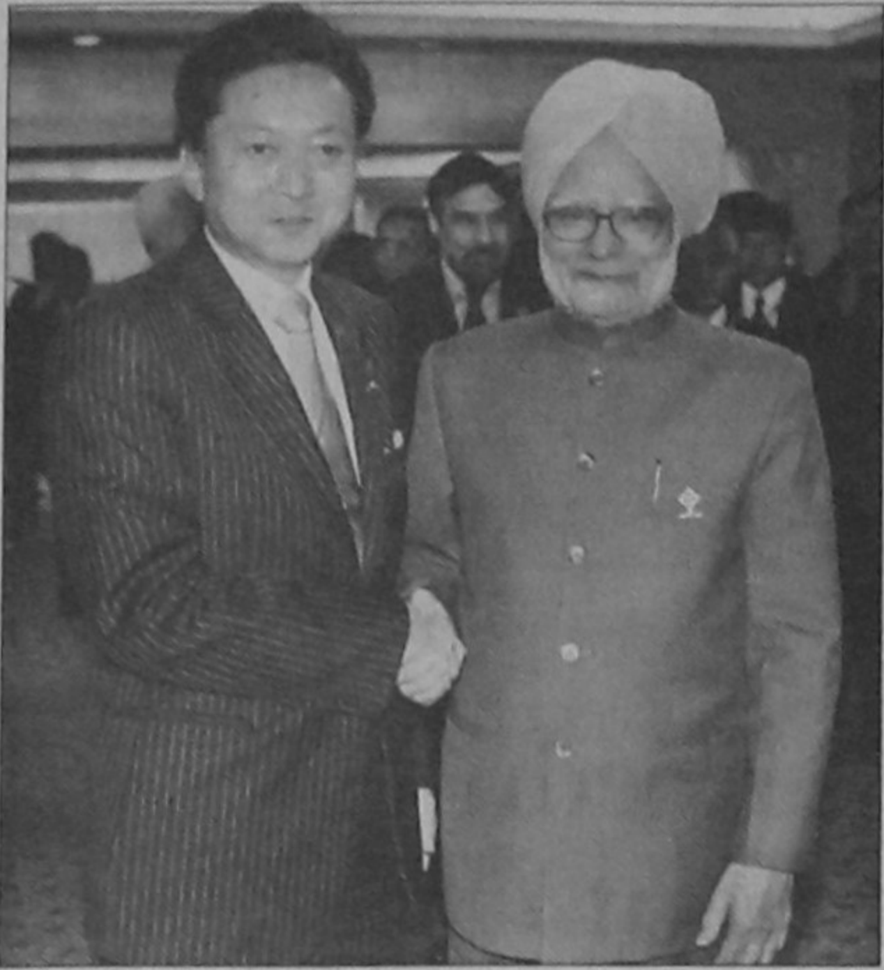
Japanese Prime Minister Yukio Hatoyama (L) shakes hands with his Indian counterpart Manmohan Singh (R) prior to their talks in the southern Thai resort town of Hua Hin yesterday on the sidelines of the 15th Association of Southeast Asian Nations (Asean) summit.