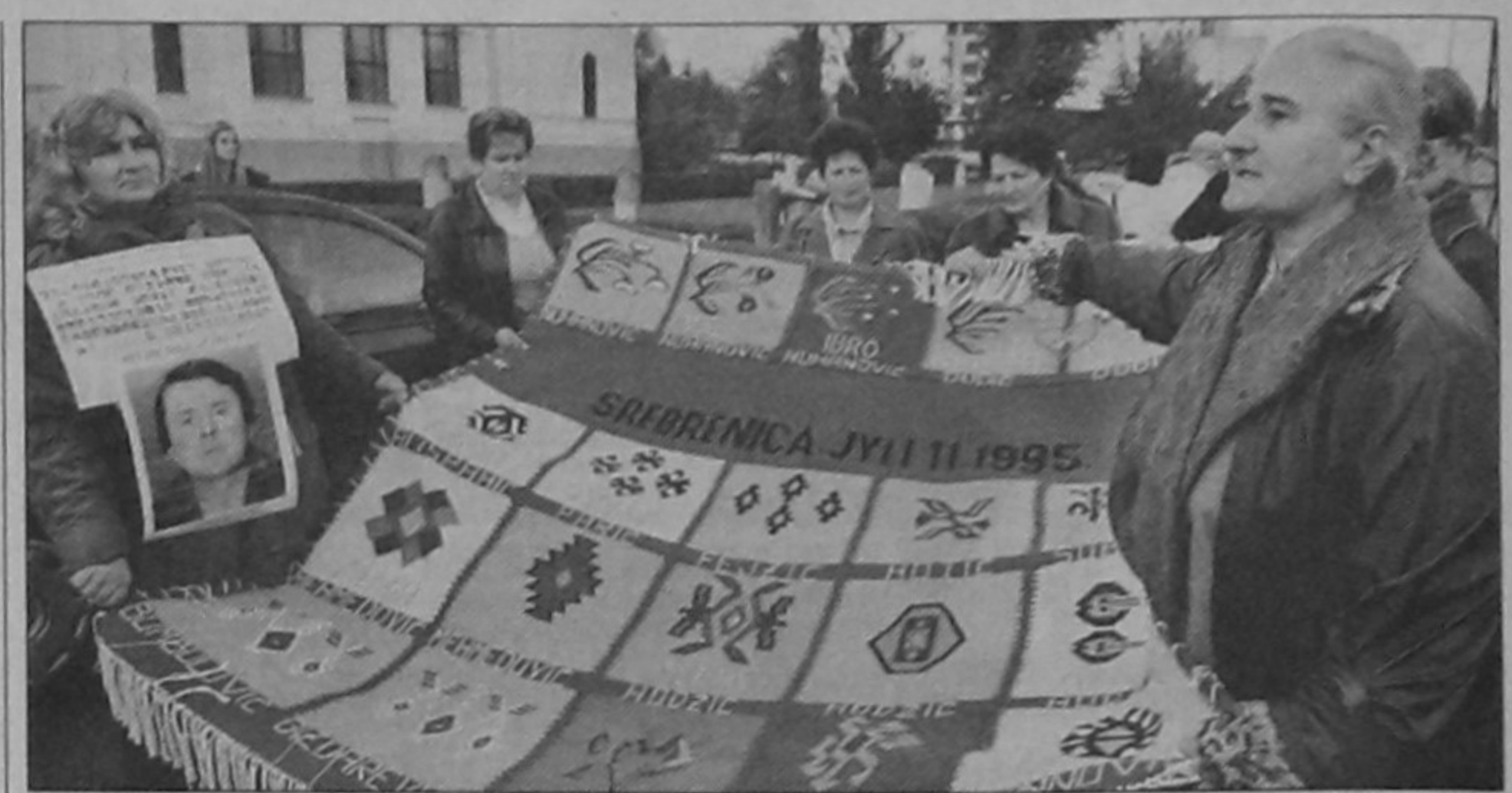
Bosnian Muslim women from Srebrenica hold a hand woven carpet with the names of their killed relatives embroidered before boarding a bus in Sarajevo early yesterday. Buses carrying about 200 Bosnian Muslim family members of the war victims departed Sarajevo for the Hague, Netherlands, to demand swift trial and severe punishment for Serb leader Radovan Karadzic.