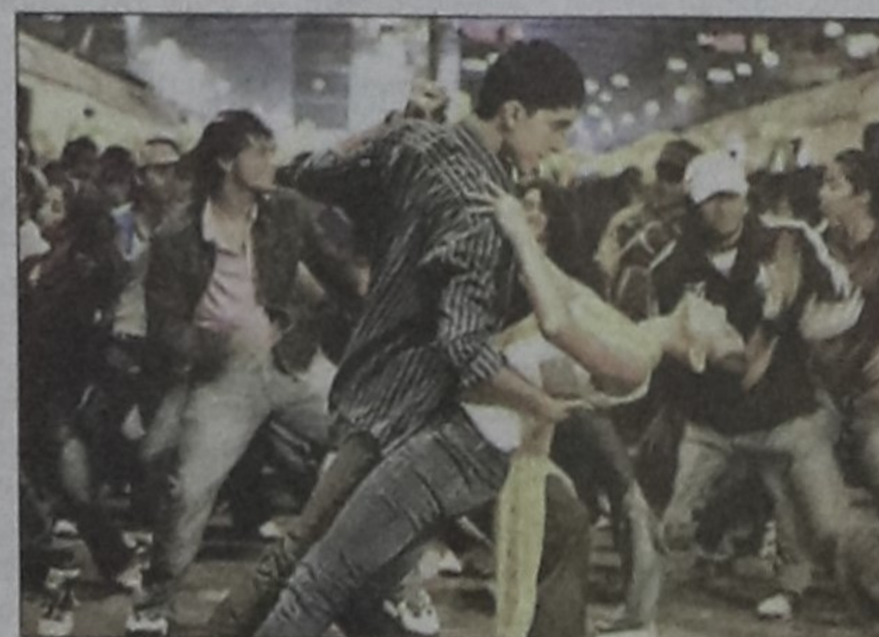
The song from "Slumdog Millionaire" won the award for "best original song written for film".