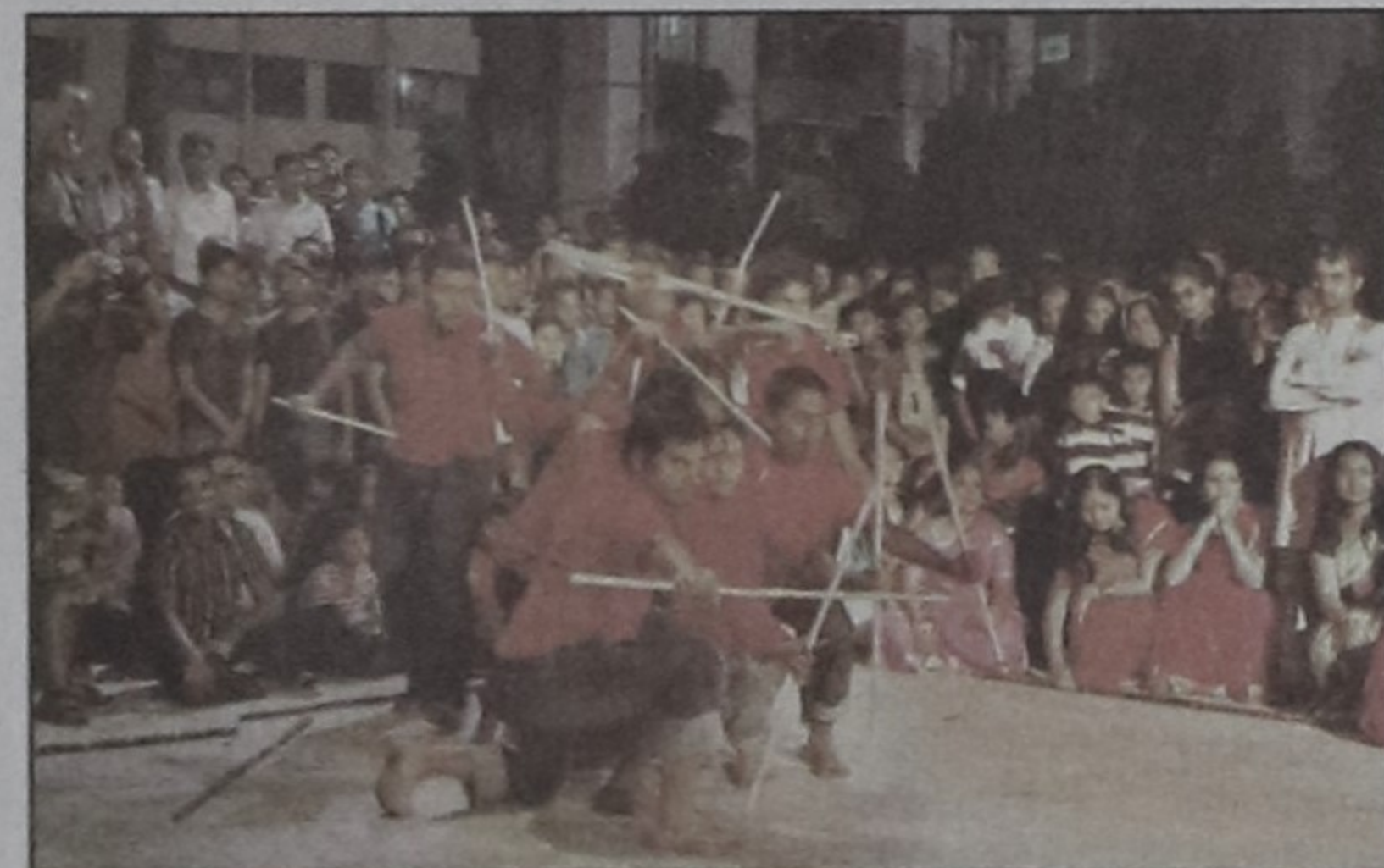
Members of Prachyanat (left) and Nrityanchal perform at the inaugural programme.

Apart from plays, the festival also features seminar and an award giving ceremony. The seminar will be held this morning at the Seminar Hall, BSA. The award giving ceremony will take place on the concluding day (October 25) at the Experimental Theatre Hall.