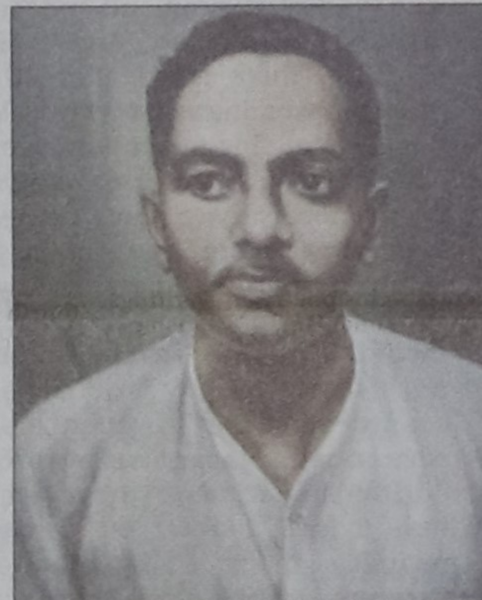
A portrait of Jibanananda Das.

They said Jibanananda Das was a trailblazing Bengali poet of his time. His poetic imagination was a notable feature of 20th