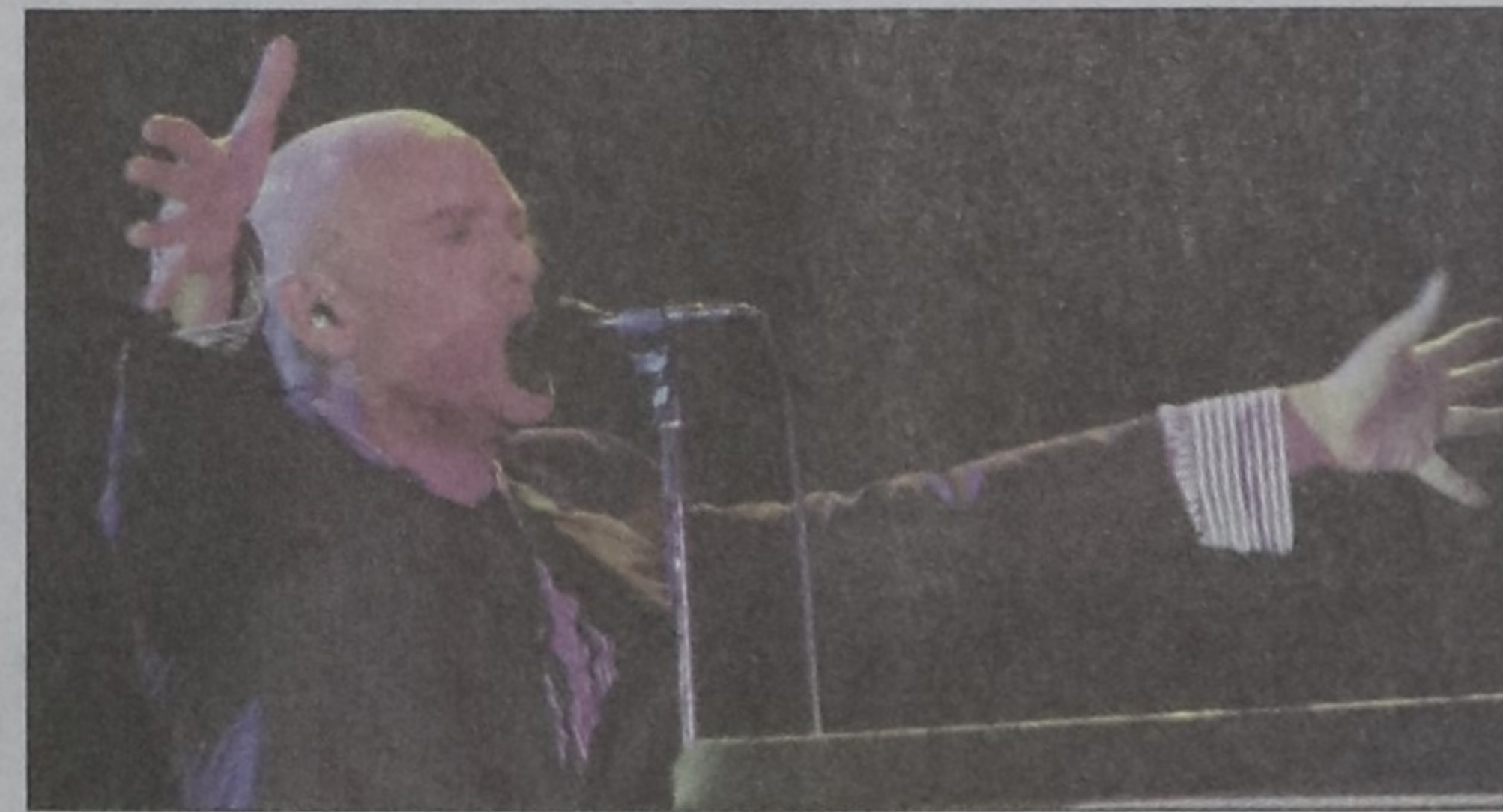
REM's Michael Stipe is backing the campaign